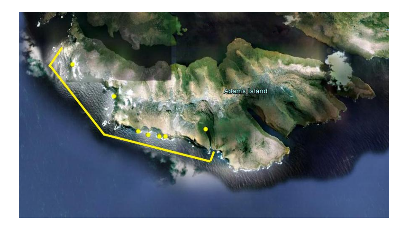
Figure 2. The extent of survey work undertaken on Adams Island in 2014. Yellow dots indicate waypoints where nesting light-mantled sooty albatross were photographed.

Figure 1. Areas of Disappointment Island where light-mantled sooty albatross were found to be nesting (yellow dots).