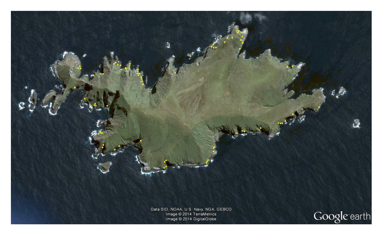
Figure 1. Areas of Disappointment Island where light-mantled sooty albatross were found to be nesting (yellow dots).