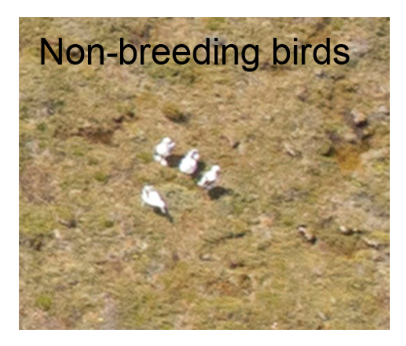
Figure 3. Examples of images of southern royal albatrosses and their breeding status assessed from aerial photograhs.