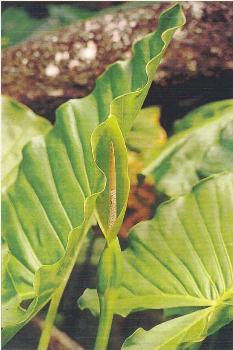
Figure 18 Aroid lily flower and foliage, October 1994.

recovered to produce much more dense shade. The aroids in the forest persist as large rhizomes (up to 60 x 10 cm) with one or two stunted leaves protruding from the end. It is a matter of time before the starch reserves of the rhizomes are exhausted and the plants under the forest die out.