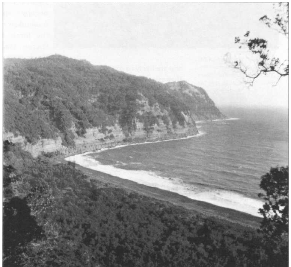
Figure 16 View onto the south end of Denham Bay with a group of young Norfolk pines visible on the edge of the beach, 1944.