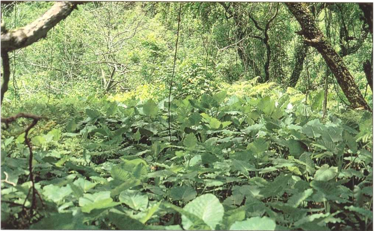
Figure 19 Aroid lily growing in a light gap at the south end of Denham Hay. Black, vertical, slim stems in the photo are grape vines, October 1994.

Widespread distribution throughout Raoul and onto the Meyer Islets has probably resulted from birds dispersing the seeds. Vegetative reproduction will occur from fragments of the rhizomes rolling down hills. The goats probably caused a fair amount of rhizome damage when moving through the forest and they could have enhanced the rate of spread in this way. Because aroid lily is bird-dispersed its spread is unpredictable but since it covers virtually all of Raoul island and is also on the Meyers, the only places it can infest now are the other small islets adjacent to the Meyers. The seed probably does not persist long in the soil, unlike Mysore thorn and others, so aroid lily will not colonise disturbed areas rapidly because the seed will have to be dispersed into the area. If rhizomes are already present, then they could grow rapidly in high-light conditions created following tree falls, slips, etc.