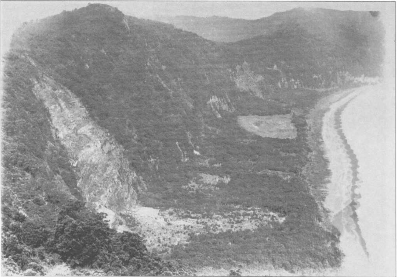
Figure 15 View south along Denham Bay, 1908, with no sign of Norfolk pines.