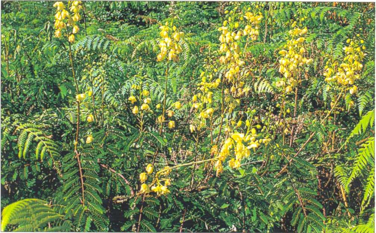
Figure 3 Mysore thorn flowering in a ferny clearing in Denham Bay, August 1990 (Photo: W.R. Sykes).