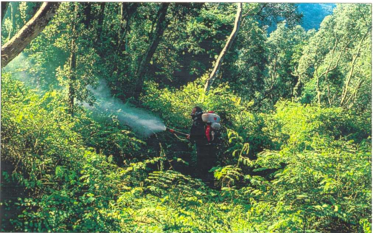
Figure 4 Knapsack spraying of Mysore thorn in Denham Bay, 1976.