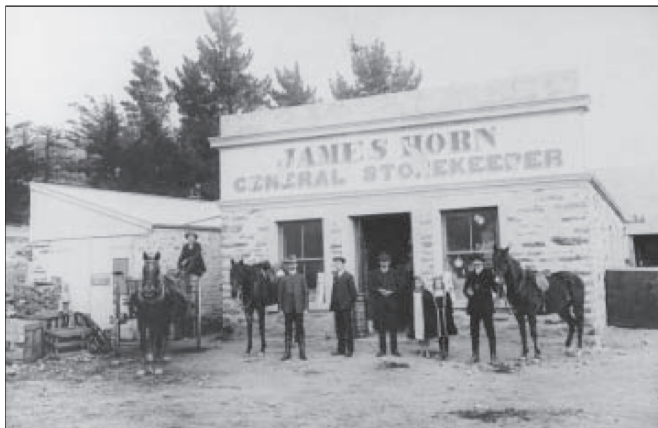
Figure 13. General store, Bannockburn, 1910.

earthworks. By 1869 the banks of the Kawarau River had been sluiced. In 1873, Baileys Gully (also known as Raupo Gully) at Bannockburn, an area that already been surface sluiced, was reworked, and the miners broke through a false bottom to relatively rich ore bearing layer (Parcell 1976: 35–37). The whole of Templars Hill had been sluiced away by April 1883 (Parcell 1976: 33).