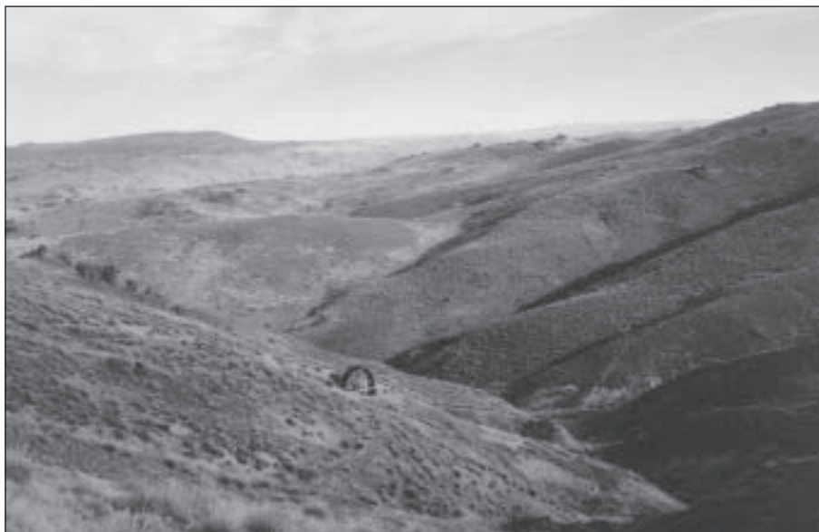
Figure 4. The Young Australian water wheel and mine, Carrick Range. Peter Petchey 2003.

Bannockburn. Apart from a few orchards and mixed farms on the terraces around Bannockburn settlement and closer to the Kawarau River, pastoral farming was the only viable form of agriculture until the recent advent of viticulture. The presence of gold and coal largely shaped the landforms and settlement form we see today.