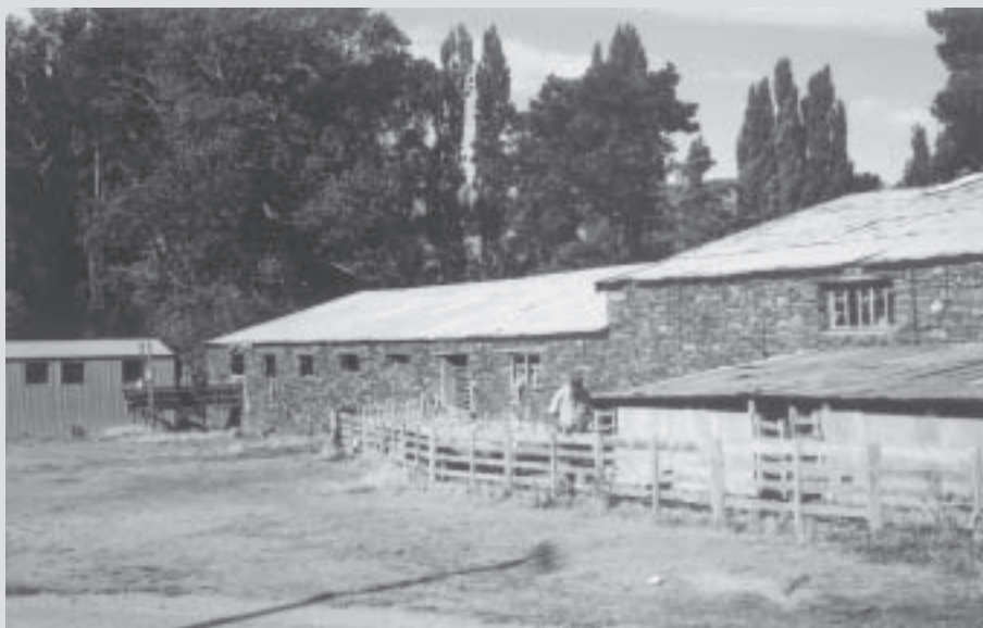
Figure 8. Stone woolshed, Kawarau Station. Peter Petchey 2003.

The continued influx of miners followed new gold discoveries around Otago. There were no formed roads or bridges: miners carried heavy swags or drew handcarts, probably initially along the rough tracks that served the stations, and from there into the uncharted hills and valleys, creating new routes as they went. New economic opportunities arose in their wake, for accommodation,