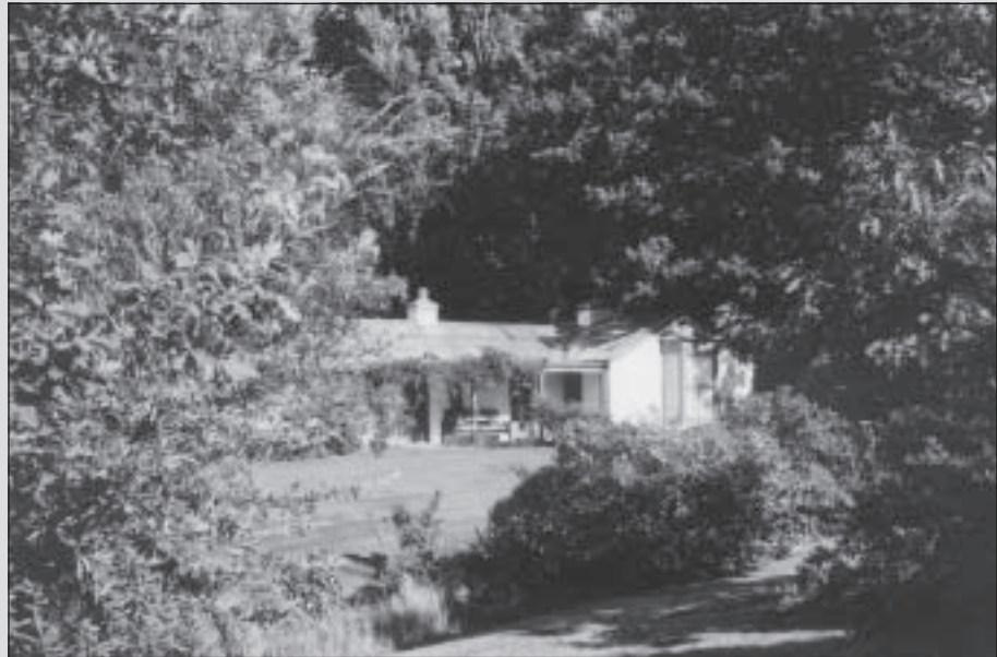
Figure 6. Kawarau Station homestead. Peter Petchey 2003.

The scale and layout today is much as it was described in early plans of the area. The 1862 survey of the 92 acre pre-emptive right for Kawarau Station shows the homestead and the station buildings (SO 16356) (Fig. 7). The buildings are clustered around Forkburn (later Shepherds) Creek. A house, storemen's house, and stable stand in close proximity, with the woolshed across the creek, a little way off.