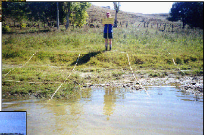
Plate 3. (Right) Control Plot 2, view away from lake, March 2000.