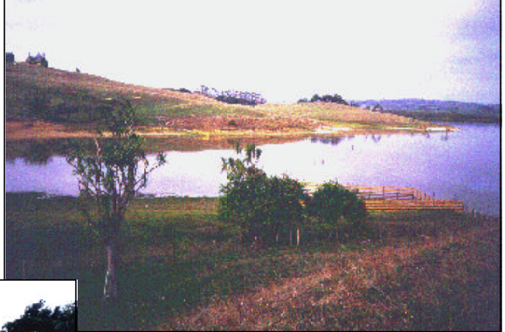
Plate 1. View of Plots 1 (background) and 2 (foreground).