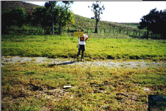
Plate 2. (Left) Control Plot 2, view away from lake, March 1998.