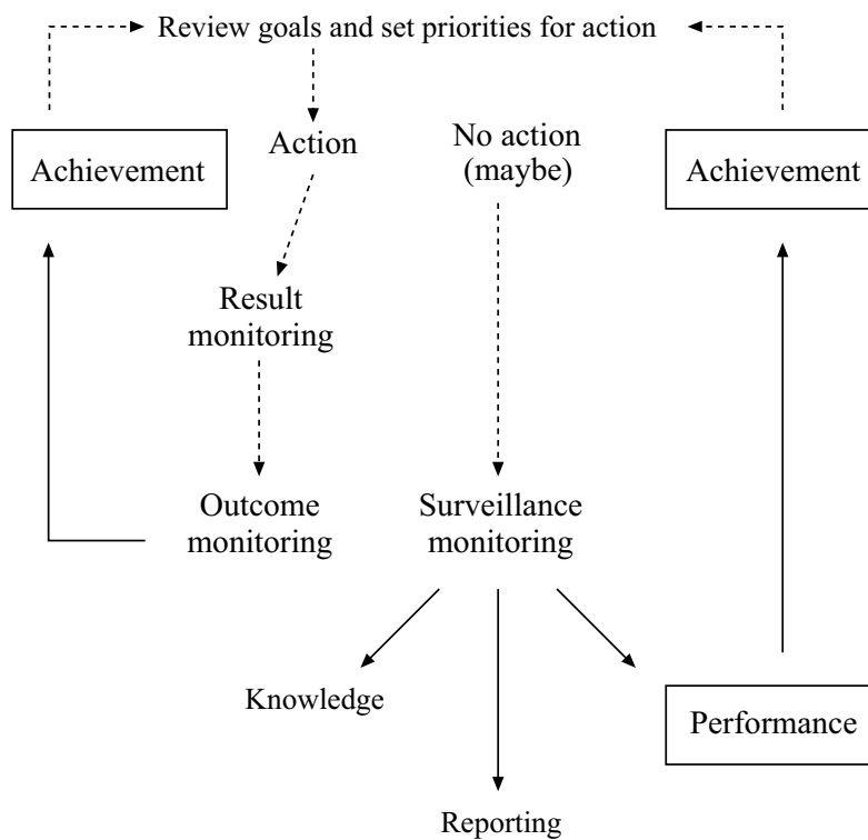
Figure 1. Indigenous forest assessment for decision-making purposes (boxes) and the nature of monitoring used to achieve these (Figure from Allen 1999).

part of a 'Status System' (Fig. 1), and, as outlined above, a national monitoring network can provide capacity to interpret and report on trends in indigenous forests. A national monitoring network can also be employed in 'surveillance monitoring', a term used by the Department of Conservation (1999) to describe the biological inventory component used for evaluating conservation performance, as well as for reporting on conservation assets and increasing baseline knowledge. Whereas 'outcome monitoring' considers what biological data are required to measure conservation achievement, 'surveillance monitoring' can contribute to evaluating conservation achievement by defining 'status' in the absence of active management, e.g. to provide background information from a wider area against which to assess local operations to control animal pests. Surveillance monitoring will thus reveal whether applied management accords with conservation goals (Bakker et al. 1996). Surveillance will also alert managers to new impacts, such as those brought about by the invasion of new exotic weeds.