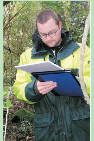
The Inventory and Monitoring Toolbox establishes national standards and specifications for inventory and monitoring methods.