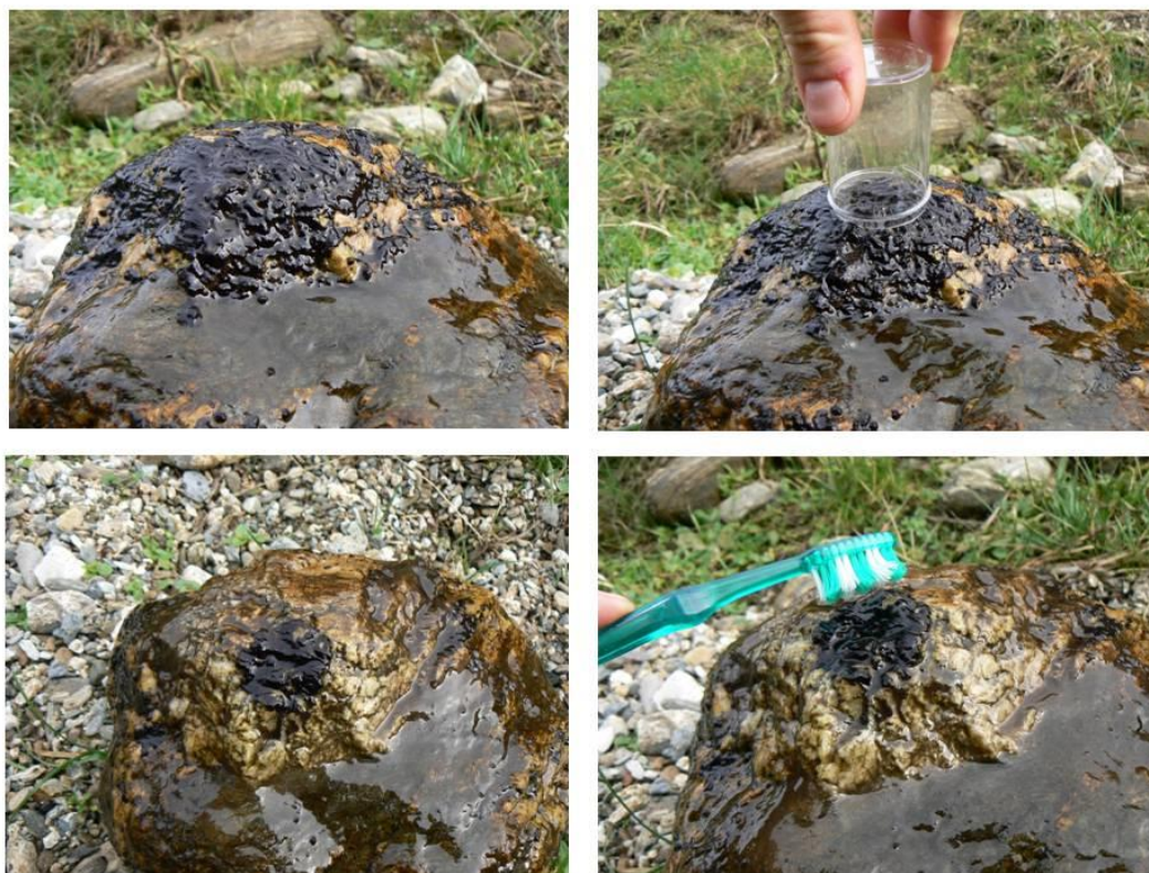
Figure 3. Quantitative periphyton sampling of a known area of the upper surface of stones, method 1b. Top left: a randomly selected stone is placed on the bank ready for sampling. Top right: a template of known area is used to protect the sample while all the unwanted periphyton around it is removed. Bottom left: periphyton sample after removal of surrounding material. Bottom right: the sample is carefully collected using a toothbrush.