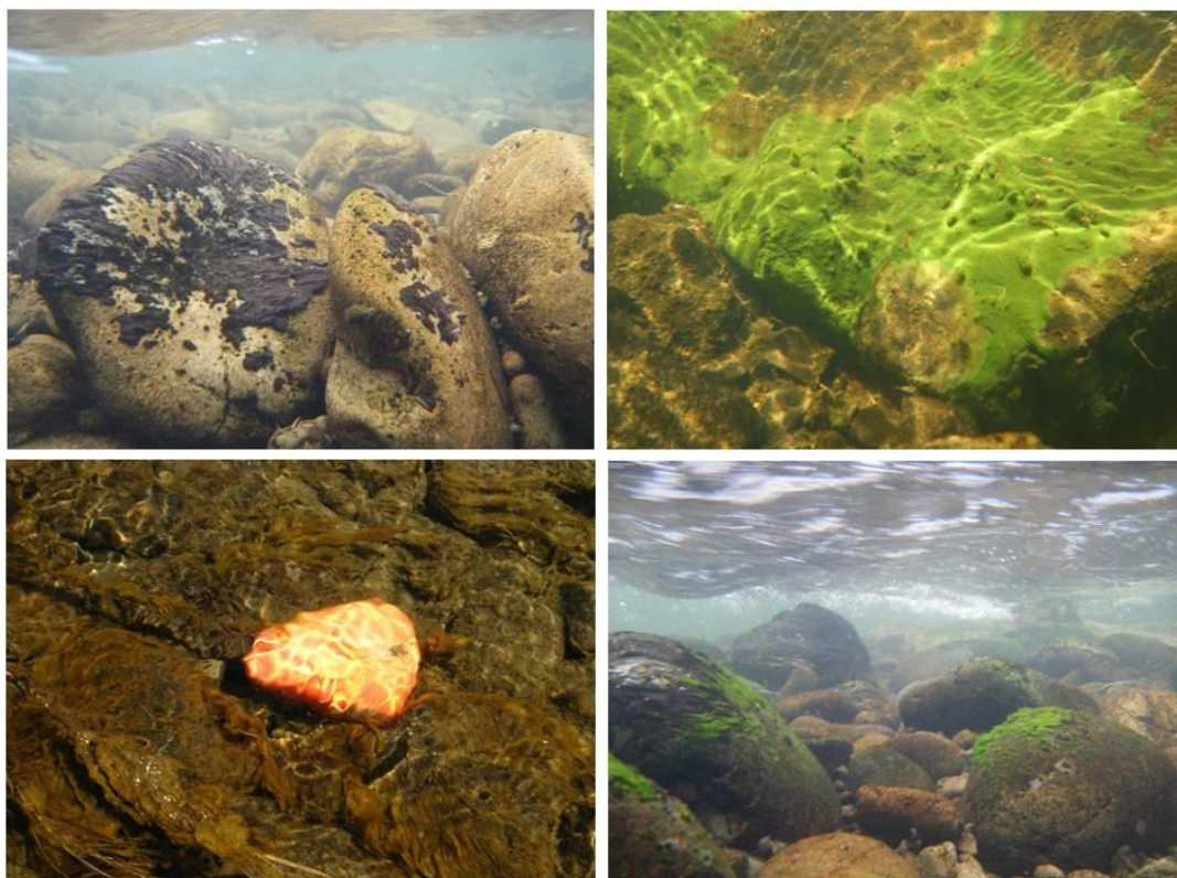
Figure 1. Examples of periphyton types commonly associated with nutrient enrichment and stable flows in streams. Top left: medium, possibly thick, dark brown mats. Top right: medium thickness green mat. Bottom left: long brown filaments adhere to rocks adjacent to a tracer stone used to measure stream bed movement. Bottom right: medium thickness dark brown mats and short green filamentous algae.