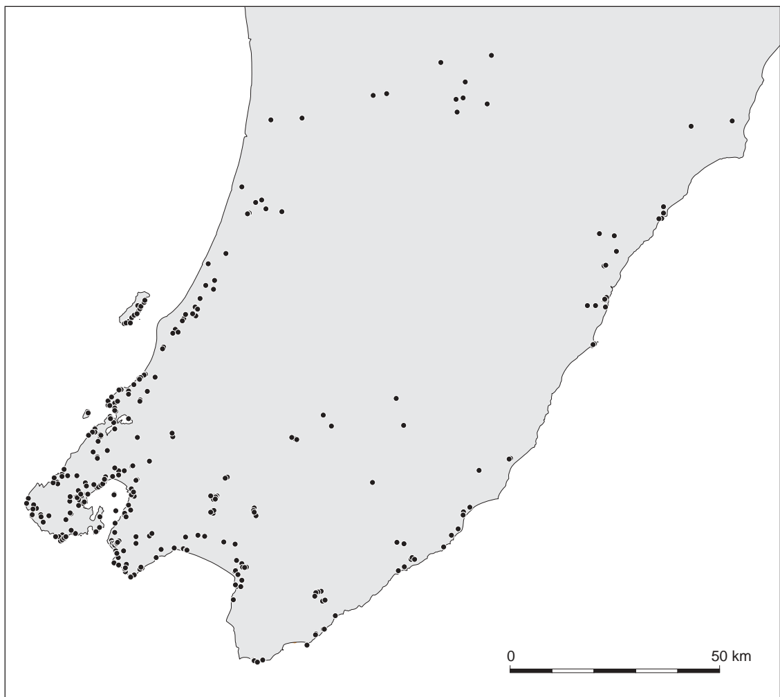
Figure 3. Distribution of karaka in Wellington Conservancy (data taken from the Department of Conservation's national BIOWEB database).

Karaka has been extensively used by Maori as planted trees around their settlements. As a result of this early form of management it has a wide distribution and is found, often in abundance, in many parts of New Zealand (Fig. 2). Continued use of karaka in this way will ensure the survival of the species in the landscape. Karaka will continue to be used in restoration and revegetation projects in Wellington Conservancy, and for that reason will remain a significant component of the regional flora.