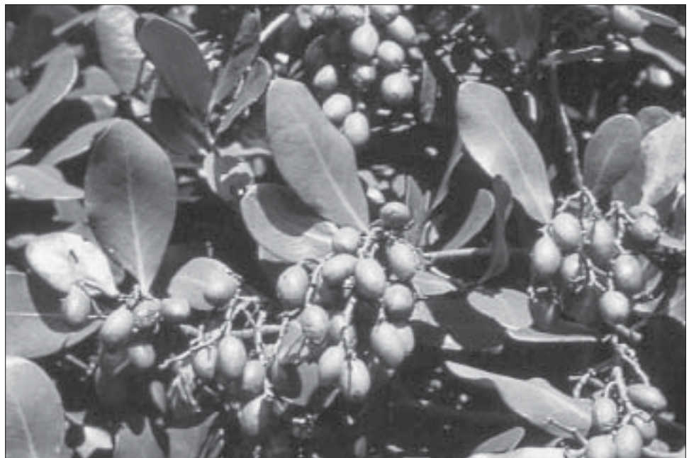
Figure 1. Karaka ( Corynocarpus laevigatus ) showing the dark green glossy leaves and the smooth club seed.

Karaka is an evergreen tree, with dark green thick glossy leaves (Fig. 1), that grows to 20 m tall. It is found in coastal and lowland forest in the North Island and northern South Island (Allan 1961) (Fig. 2) and is closely related to species found in the New Hebrides and New Caledonia (Stevenson 1978). Its berries occur in clusters, are dark green, ripening to orange from late summer to winter. On Rekohu (Chatham Island), the karaka is also known as kopi and is thought to have been introduced by the ancestors of the Moriori (de Lange et al. 1998). The Latin name Corynocarpus laevigatus is taken from the features used to describe the plant: Corynocarpus meaning 'club seed', laevigatus meaning 'smooth' in reference to its fruit (Molloy 1990). The species is known in other countries as the 'New Zealand laurel' or 'karakaranut'.