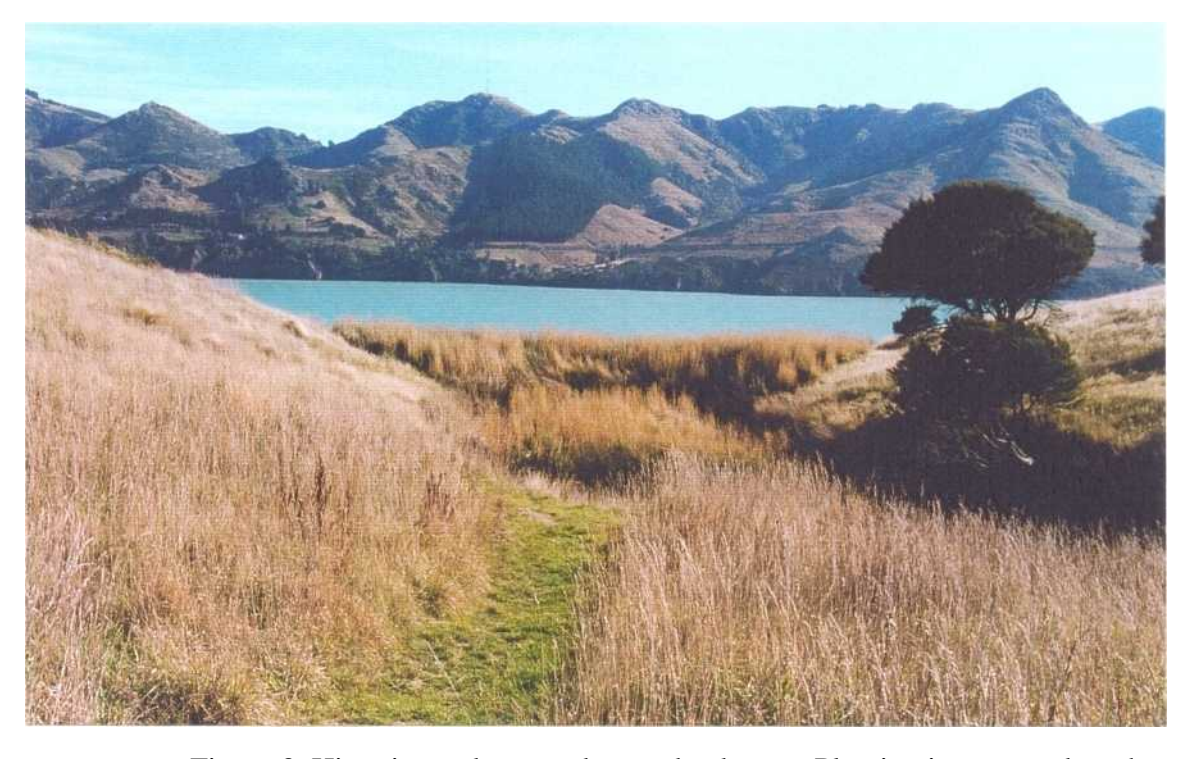
Figure 3. Historic stock water dam embankment. Planting is proposed on the slope on the right.