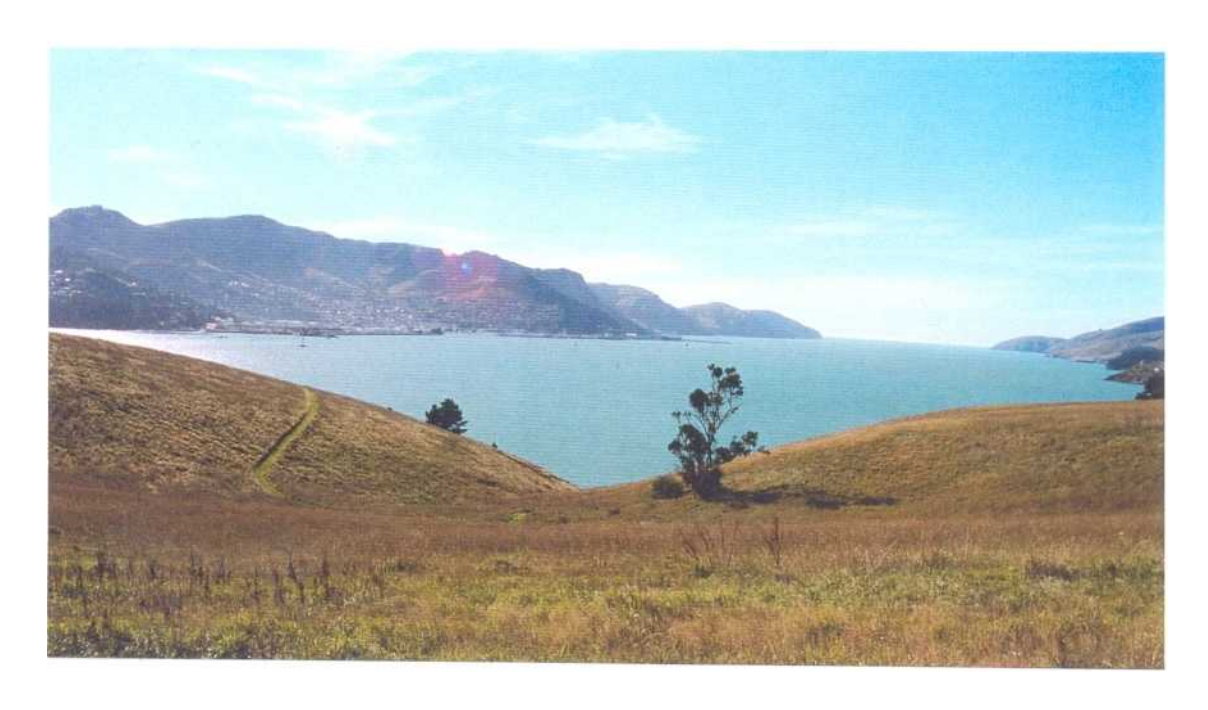
Figure 5. Photograph of Wards' cottage site 1999.