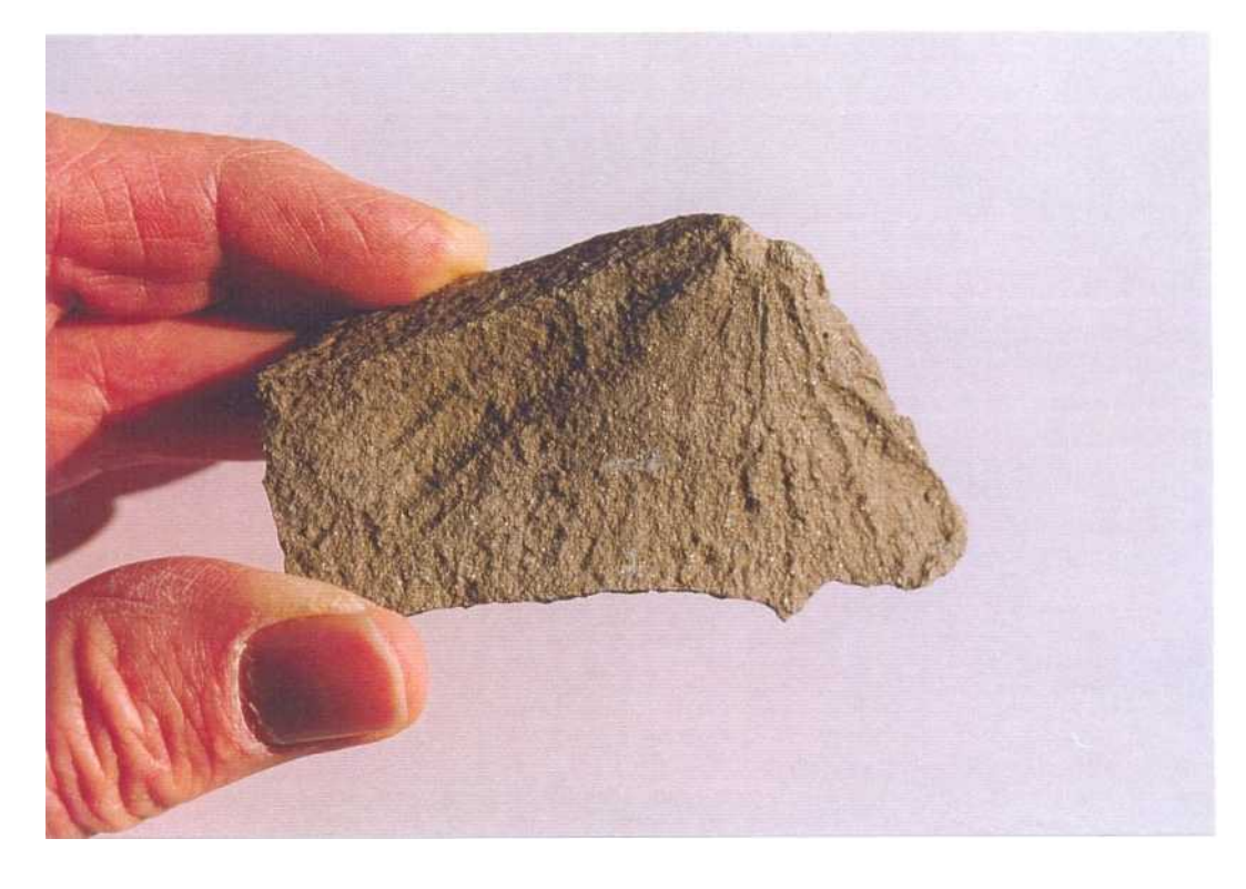
Figure 6. A spall of basalt from the hill above the Old Jetty.