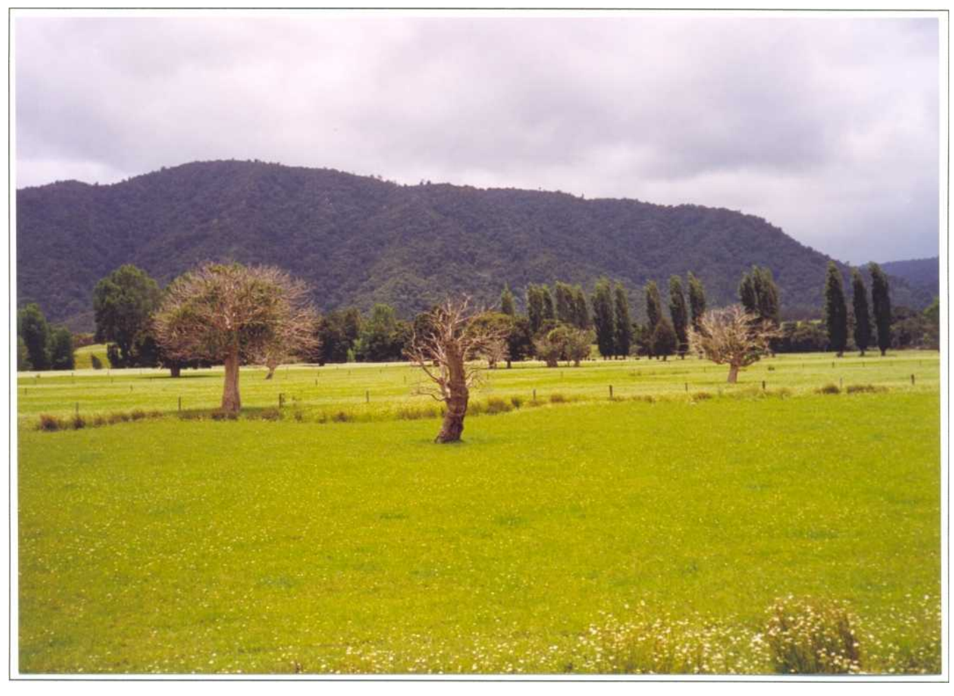
Figure 2: Final stages of decline of unprotected trees in pastoral environment - Waihou Valley, Northland.