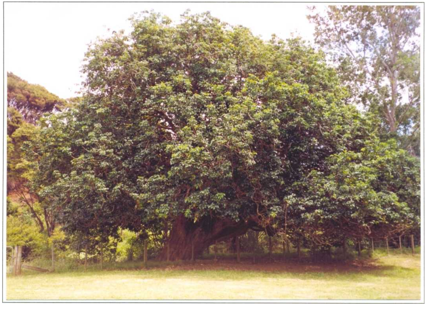
Figure 5: Similar tree and same river flat as Figure 4 but fenced in a DOC reserve - Waikawou Bay, Coromandel Peninsula.