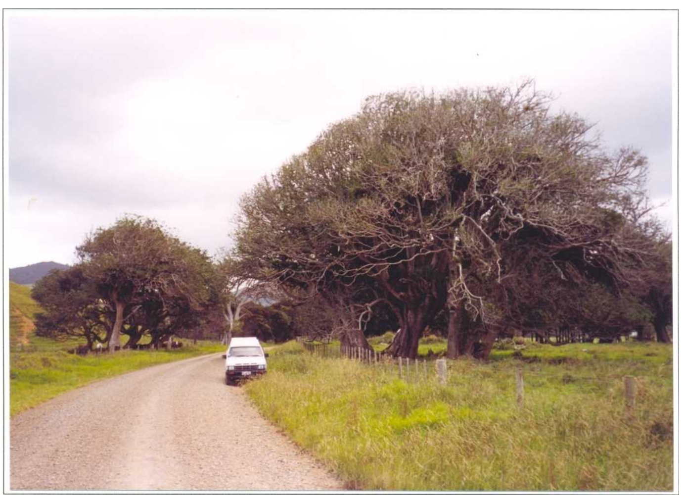
Figure 4: Old trees unprotected in a pastoral environment - Waikawau Bay, Coromandel Peninsula.