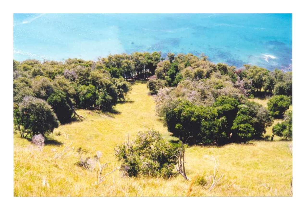
Figure 8 Forest remnant at Earthquake Slip Conservation Area, December 1998. Above: canopy of karaka ( Corynocarpus laevigatus ) and titoki ( Alectryon excelsus ), shredded by possums and wind. Below: karaka seedlings on the ground, nibbled off by goats as they attempt to provide sorely-needed regeneration.