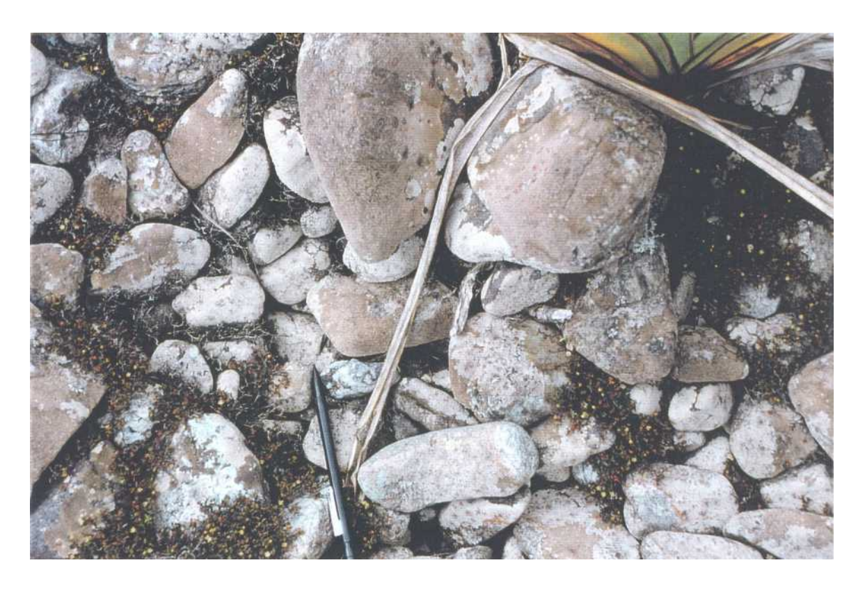
Figure 7. View of rock which a skink used for basking. Note the lichen encrusted cobble.