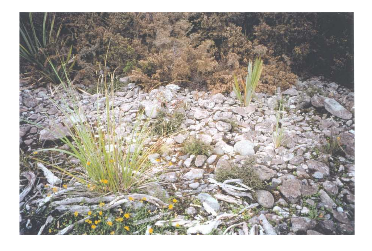
Figure 9. Gorse encroaching around the cobble of Site 3.