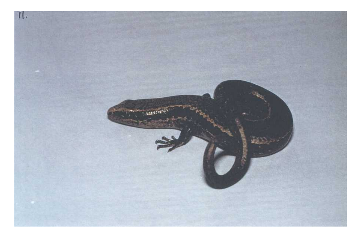
Figure 8. Typical tail wrapping behaviour exhibited by the skinks whilst they were in captivity.