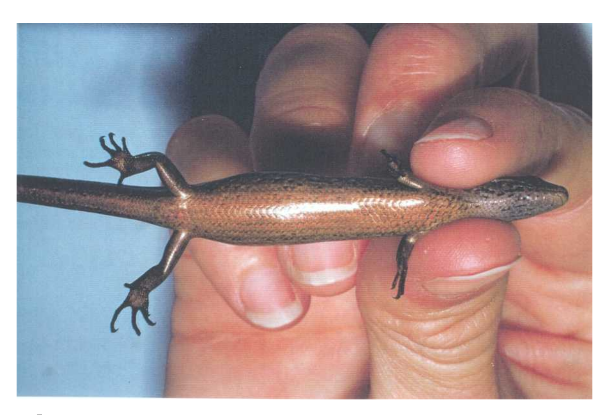
Figure 5. Ventral view of Oligosoma Big Bay showing grey chin and bronze coloured underside.