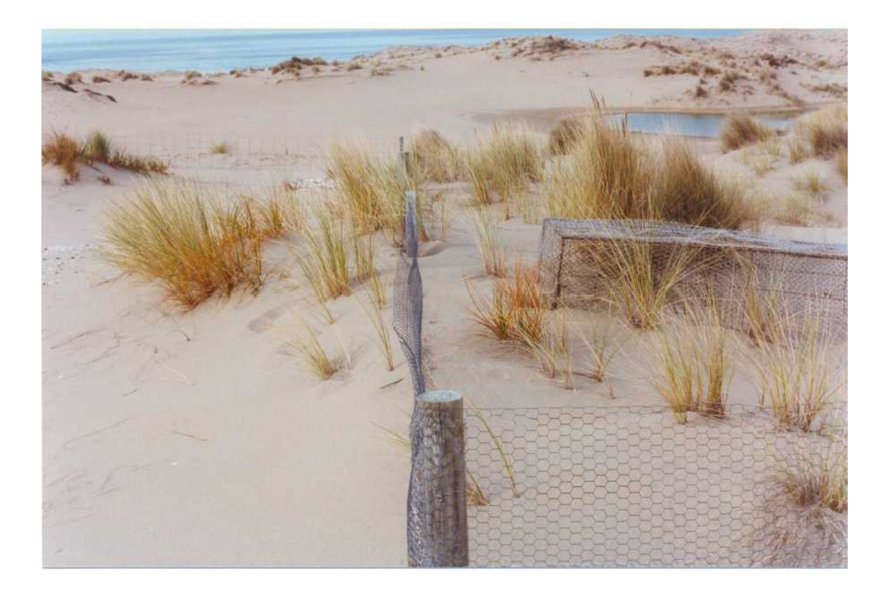
Figure 30 Top: early stages of marram grass invasion in Plot 1, marram sharing the dunes with spinifex and pingao. Bottom: a later stage at the rabbit exclosure, with marram squeezing out the pingao.