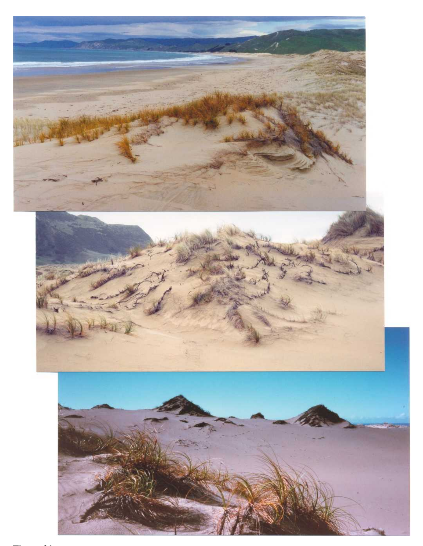
Figure 29 The natural effect of wind on adult pingao at Ocean Beach. Top: a plant dying back on the windward (right) side but flourishing in the lee (to the left). Middle: runners exposed and killed by sand deflation from an exposed dune. Bottom: dune hulks on the skyline, held together by wind-killed pingao roots; dying pingao in the foreground.