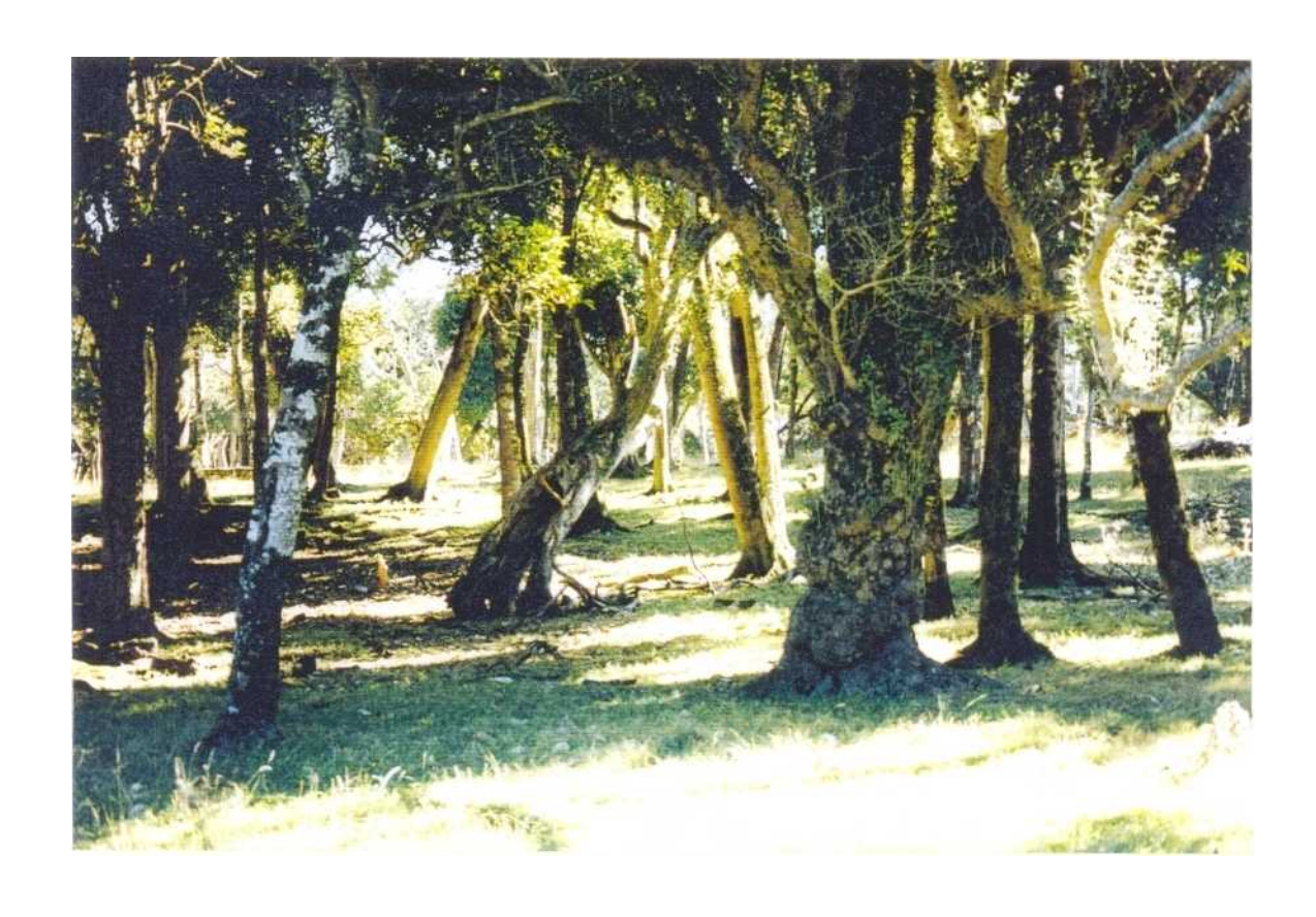
FIGURE 17 Photopoint 10, Raana Tuuta's protected private land near Tennant's Lake. In 1990, domestic stock had the run of the place (above); by 1996, after stock had been excluded for about three years, forest recovery, through epicormic tree growths and masses of seedlings, was well underway.