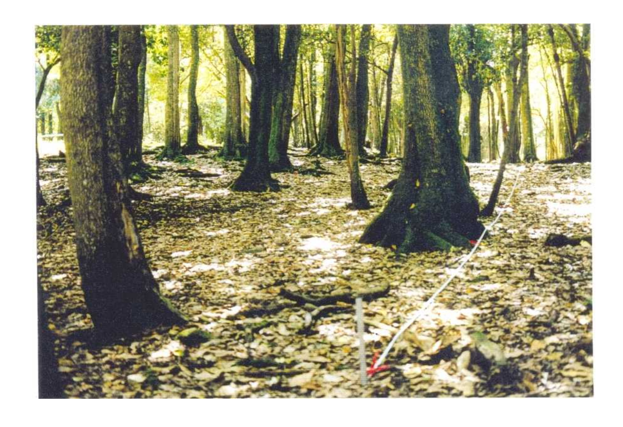
FIGURE 18 Plot 12 in Big Bush. The forest floor as it was in 1990 (above), and in 1996 (below). The difference is four years of relief from domestic stock.