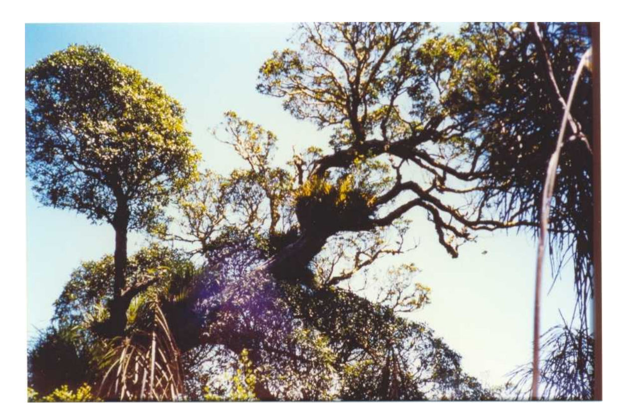
Figure 5: Lower crown regeneration on left is typical of the healthy condition 1 category. The contracting old crown represents condition 3.