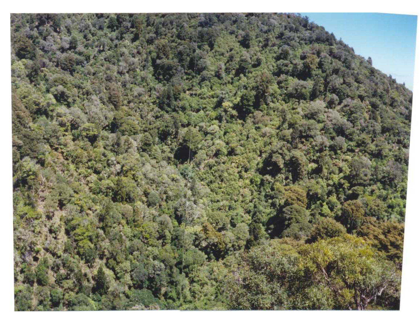
Figure 7: Typical open canopy forest with black maire dieback taken from track near site C.