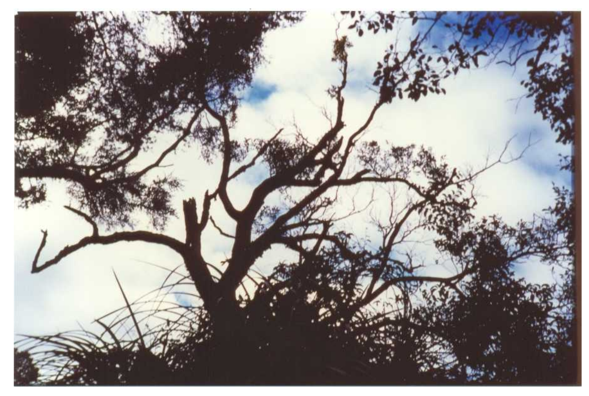
Figure 6: Severely contracted crown of a condition 4 tree although more commonly a greater proportion of dead fine branches were present.

Figure 5: Lower crown regeneration on left is typical of the healthy condition 1 category. The contracting old crown represents condition 3.