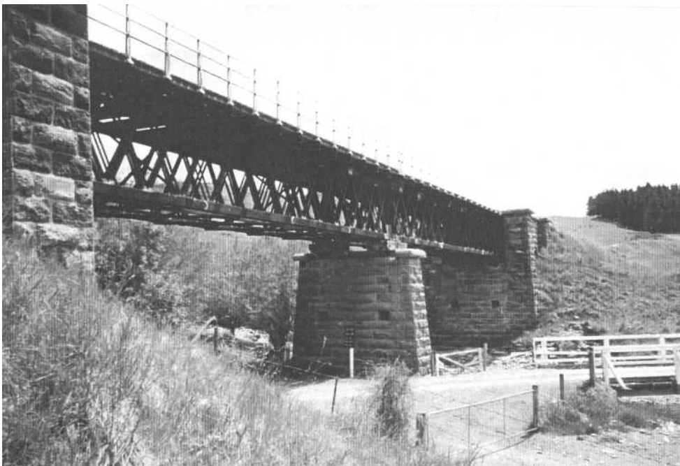
Figure 4 Bridges between Middlemarch and Ranfurly.

Top left: The trestle bridge over Heeneys Creek.