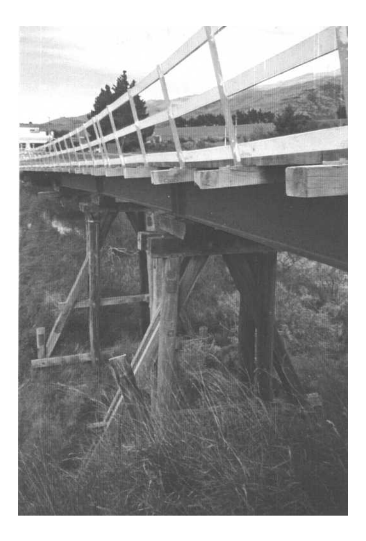
Figure 4a. Some examples of Railway style railings