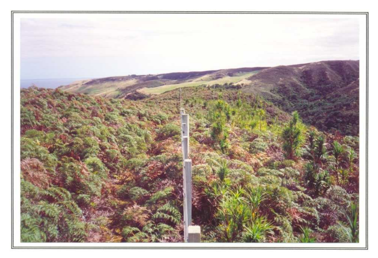
Figure 15: Vigorous regeneration of tarahinau saplings emerging from bracken within Tuku Nature Reserve, Chatham Island (right of fence); none where there are still cattle and sheep (left of fence). March 1993.