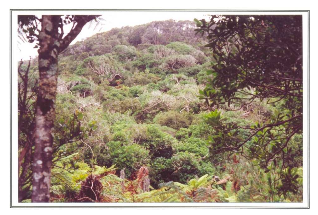
Figure 13: Kopi Forest, "Abyssinia", Tuku Nature Reserve, Chatham Island. Above: Canopy in February 1990. Below: Canopy in March 1993. Possum control since 1990 has resulted in a healthier canopy, subtly apparent in the increased leafiness of previously defoliated trees.