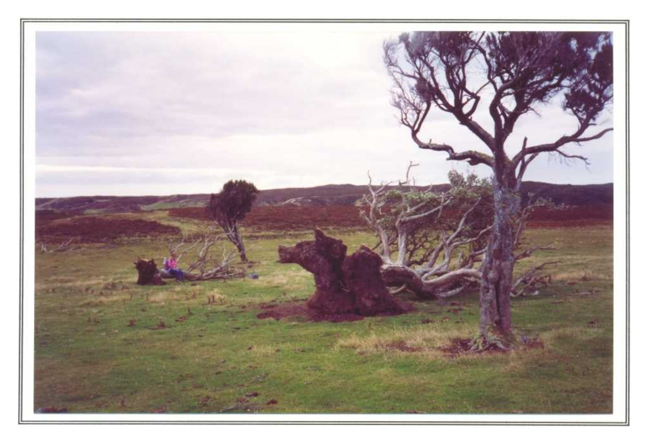
Figure 16:Wind-thrown akeake trees near Taiko Camp, Chatham Island.<br/>The tarahinau trees have withstood the gale.<br/>March 1993.

Figure 15: Vigorous regeneration of tarahinau saplings emerging from bracken within Tuku Nature Reserve, Chatham Island (right of fence); none where there are still cattle and sheep (left of fence). March 1993.