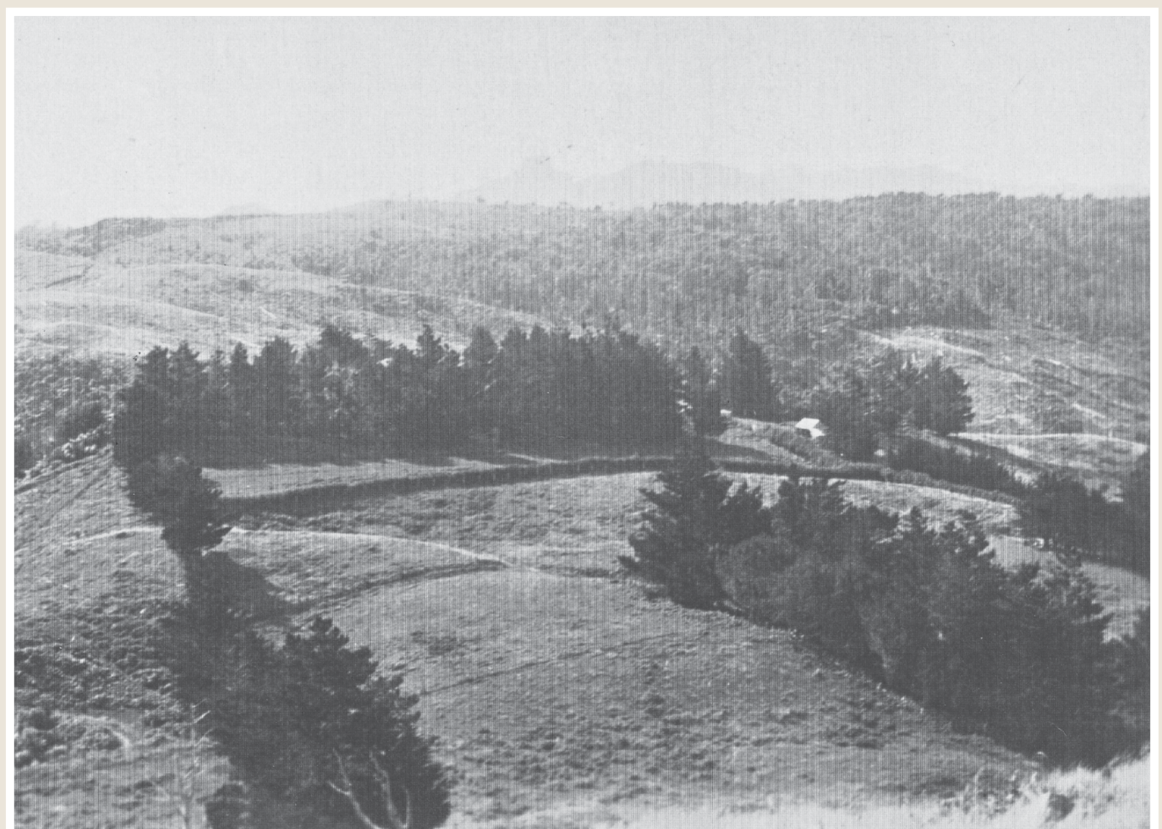
Crosbies Settlement, c. 1920s.