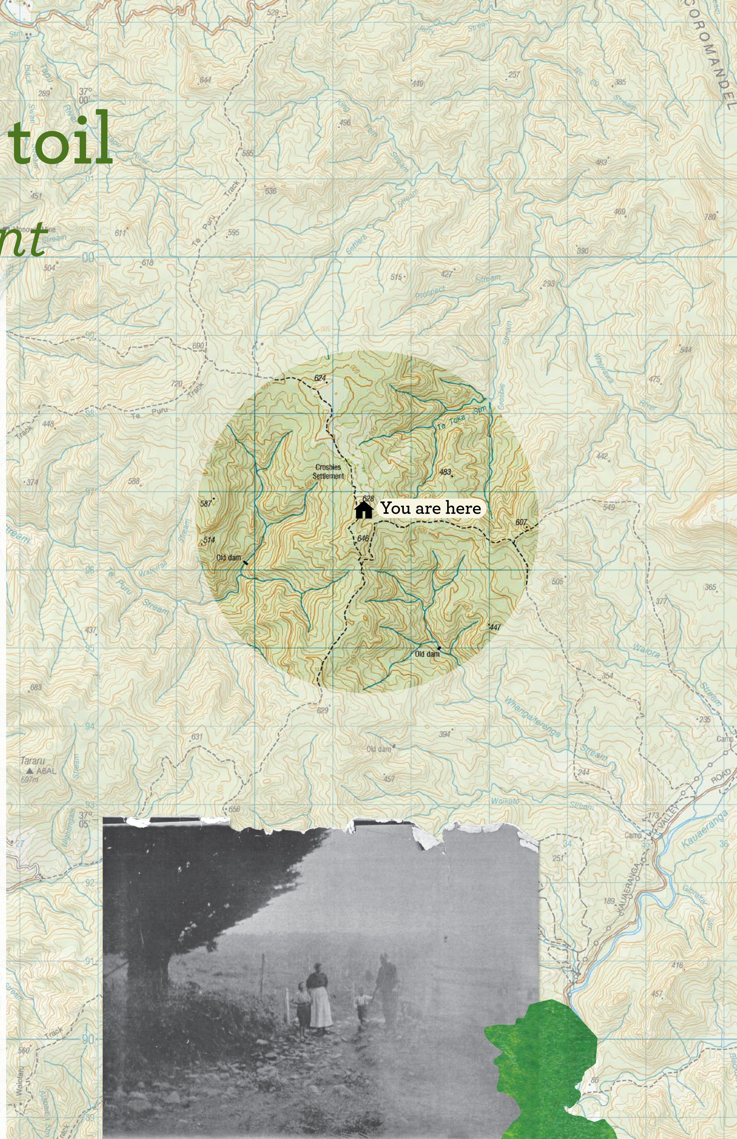
Crosbies main gate, c. 1919.

The Crosbies stayed and farmed the land here for longer than other families and the area became known as Crosbies Settlement.