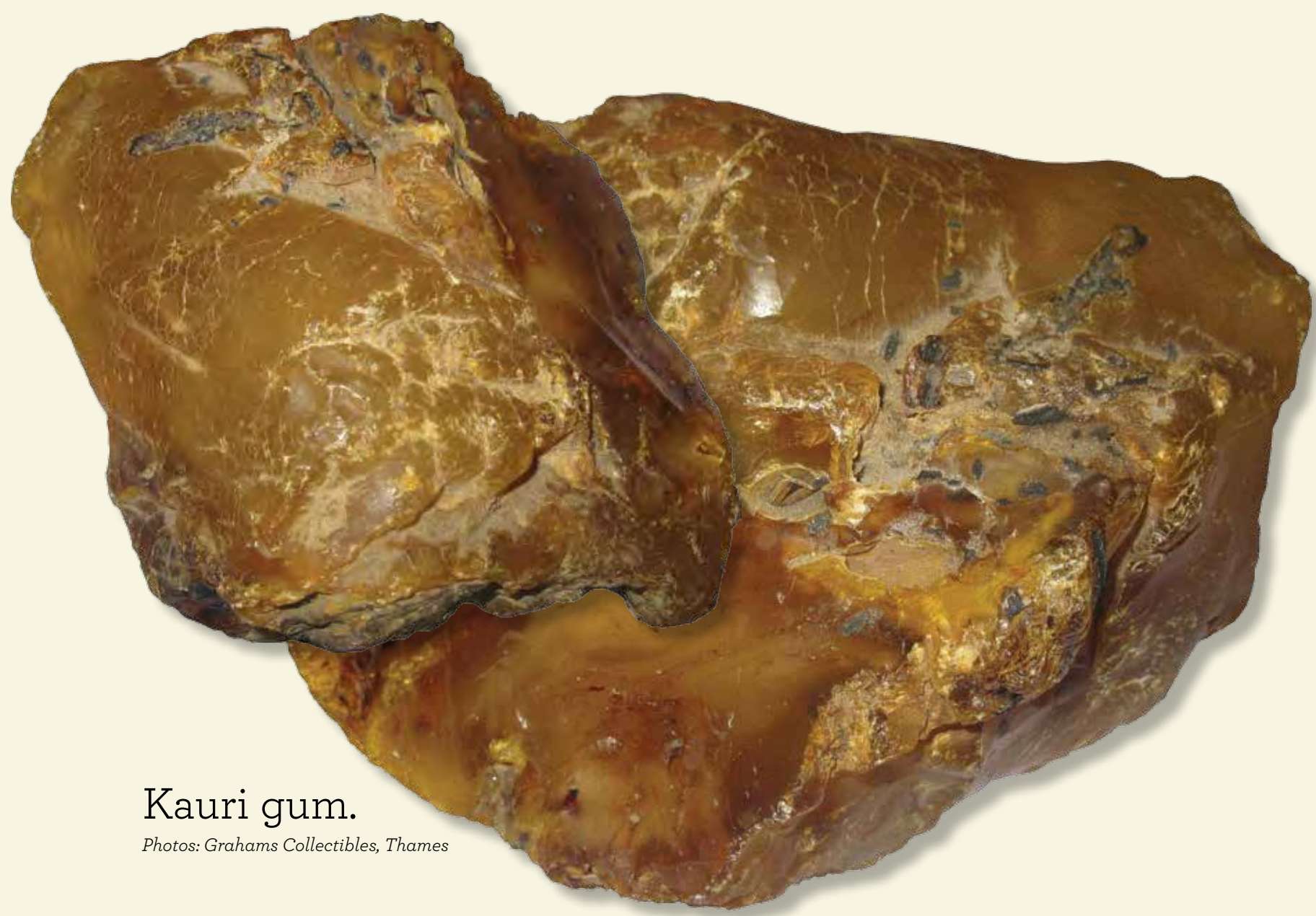
Kauri gum.