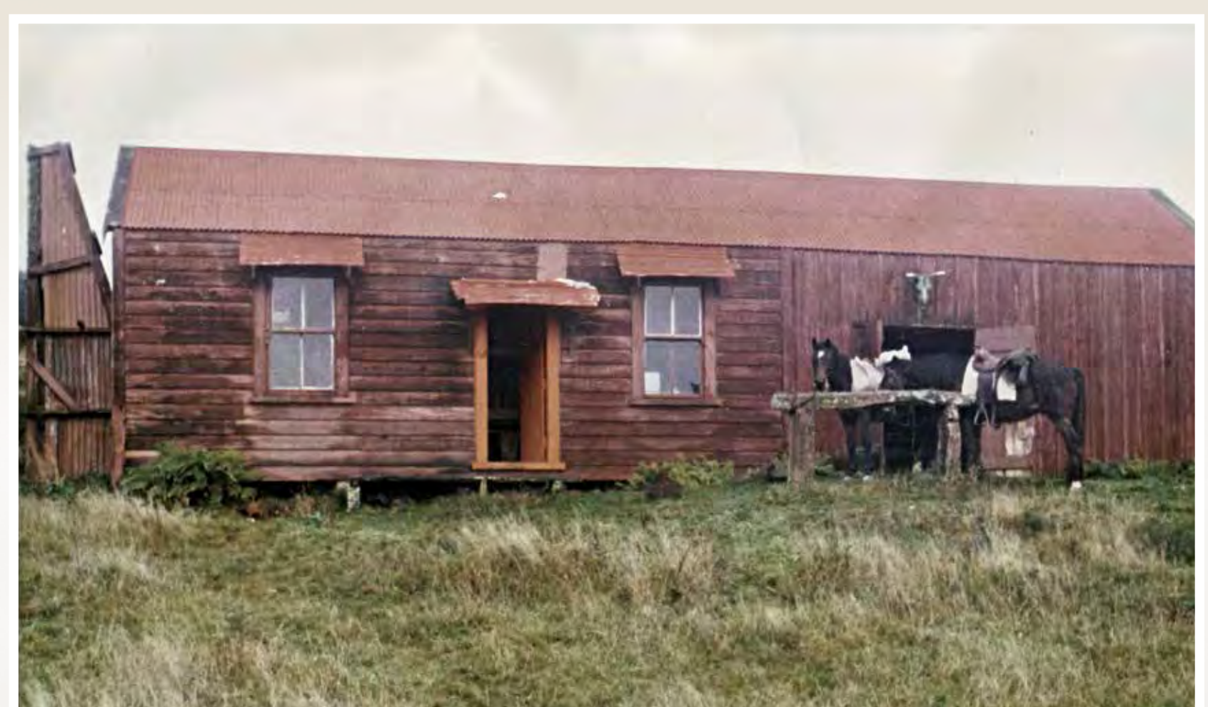
Crosbies woolshed, c. 1960s.