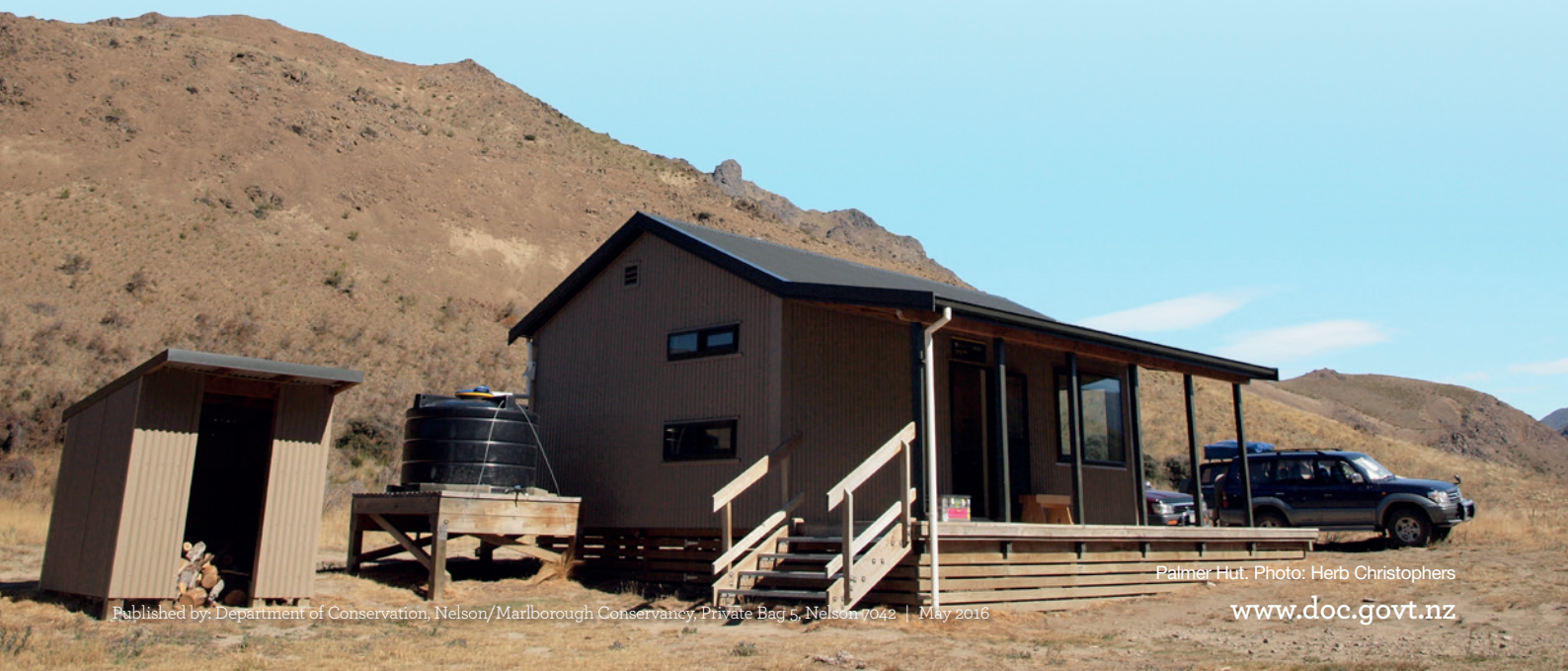
Palmer Hut.