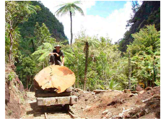
Reconstructed logging bogie on the Waitawheta Track

Follow the historic Waitawheta tramway to learn about how our giant Kauri trees supported the early gold mining industry. Beyond the rolling farmland, follow the Waitawheta River through regenerating native bush to find recreated log bogies from New Zealand's pioneering past (pictured above). The flat wide track, filled with historic signage is suitable for the whole family.