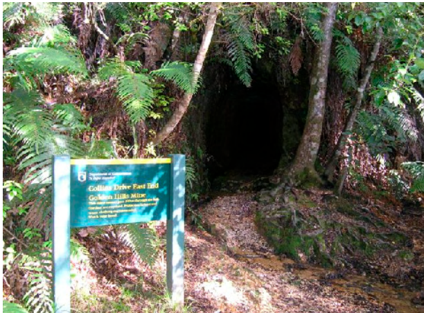
Collins Drive East end

Around the turn of the 19th century a bustling gold mining settlement of 300 people had become established at Puketui in Broken Hills. By 1914, the boom had turned to bust as production from the mines tailed off, and the town downsized accordingly.