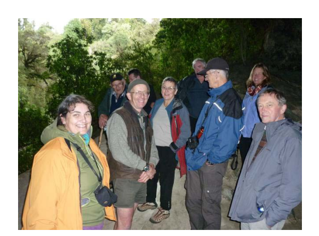
Entering the Oparara Arch Karamea