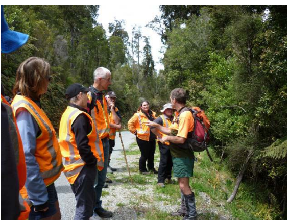
Okarito Forest, Franz Josef