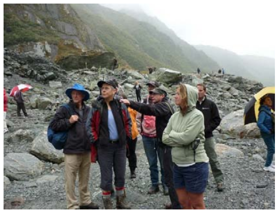
Franz Josef Glacier valley