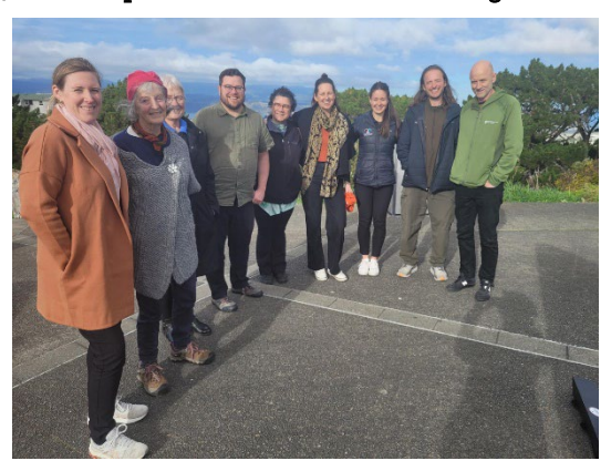
Figure 13 Predator Free Wellington - Mt Victoria