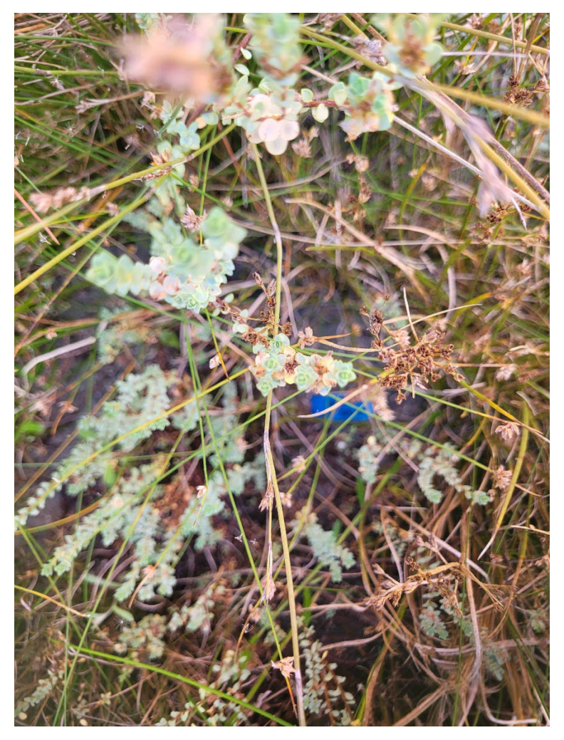
Pimelea Actea - Himatangi Beach

This report is presented to the New Zealand Conservation Authority as required by the Conservation Act 1987 and distributed to interested parties. Members of the public are welcome to attend conservation board meetings. If you would like more information on the Wellington Conservation Board please see the website <a href="www.conservationboards.org.nz">www.conservationboards.org.nz</a> or contact the board support officer, at the Department of Conservation in Palmerston North (027) 417 5246 e-mail <a href="mailto:cljacobs@doc.govt.nz">cljacobs@doc.govt.nz</a>.