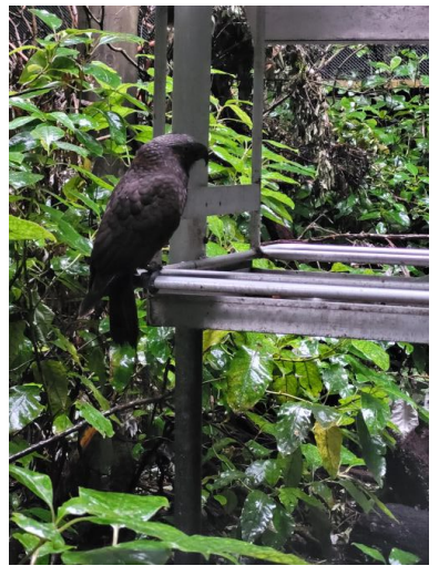
Figure 12 The Kaka