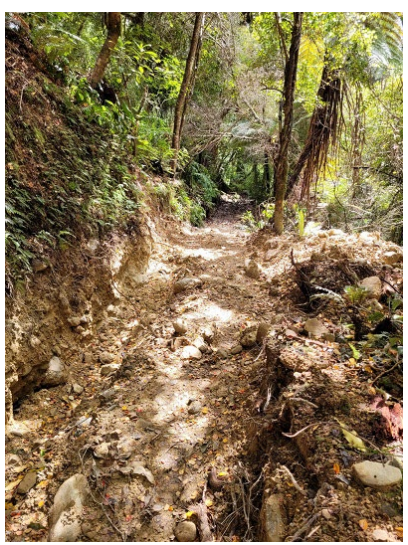
Figure 2 Pre Restoration of Donnelly Loop Track