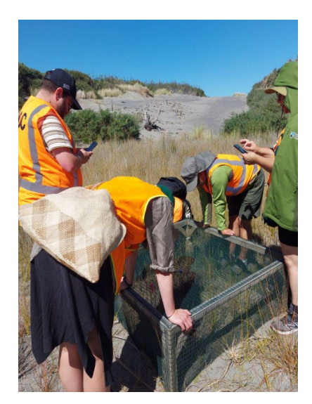
Figure 7 Site where Pimelea Actea is being protected