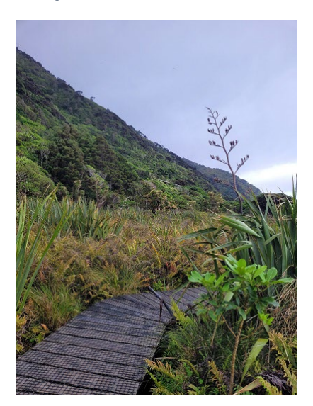
Figure 5 View from the Wetlands