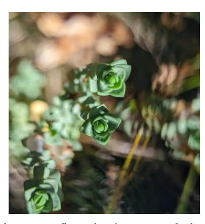
Figure 8 Pimelea Actea - flower has been magnified to view properly