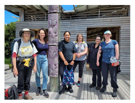
Figure 6 View from the Visitor's Gathering Area