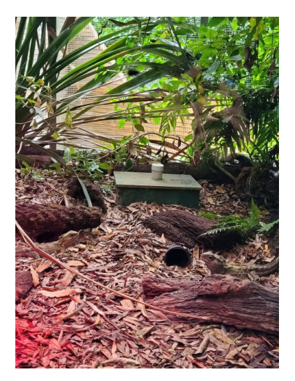
Figure 11 The Tuatara