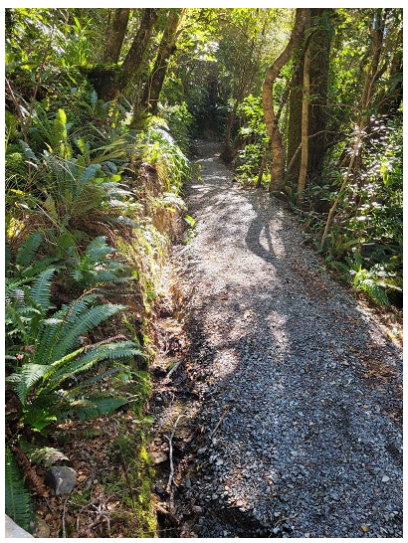
Figure 3 Donnelly Loop Track on 6 October 2023