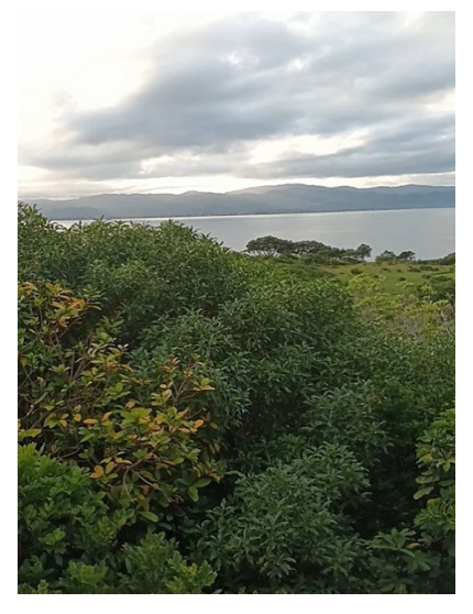
Figure 4 View from the Redhouse