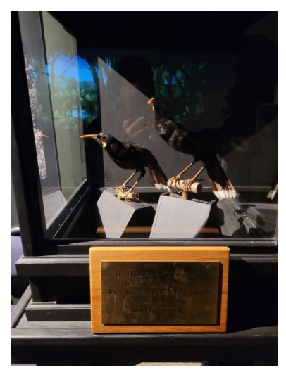
Figure 10 Extinct NZ bird - The Huia