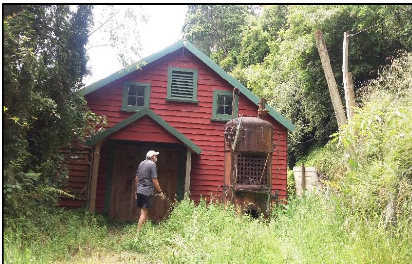
Whitebait Cannery – Waikato River – November 2017

A visit to the old whitebait cannery on the Waikato River bank provided a pleasant bonus as well as helping draw the contrast between present and past volumes of fish being caught. The cannery operated from c1910 to 1959 and the building is being restored by whitebait enthusiast, Ralph Dwen. The building is in reasonable condition and has some remnants from the canning process on display.