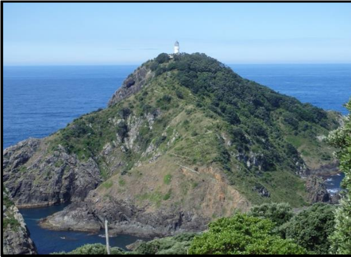
Repanga Island – March 2018

When everyone was assembled a whakatau took place with speakers from the Waikato Conservation Board, DOC and Ngati Hei and once this concluded there was an exchange of traditional greetings. Also present were representatives from Ngati Huarere ki Whangapoua. Karakia were then recited to bless those in attendance and send the tuatara on their journey.