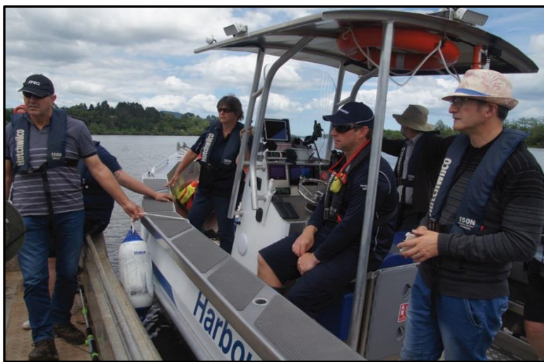
Waikato Conservation Board Members – Waikato River

The Board has taken a keen interest in whitebait issues and the fishery for some years and enjoyed this opportunity to get out on the water with DOC staff and see first-hand the river environment.