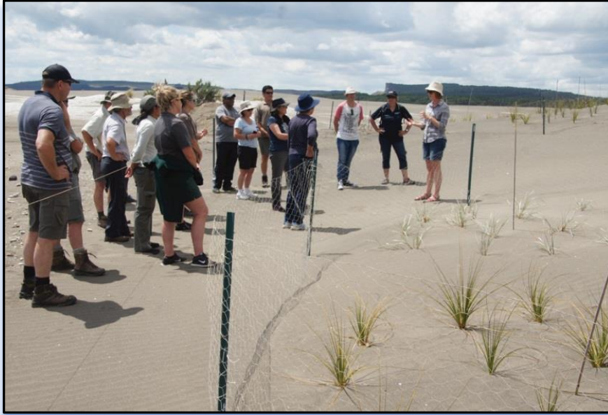
Waikato Conservation Members Field trip to Port Waikato - November 2017