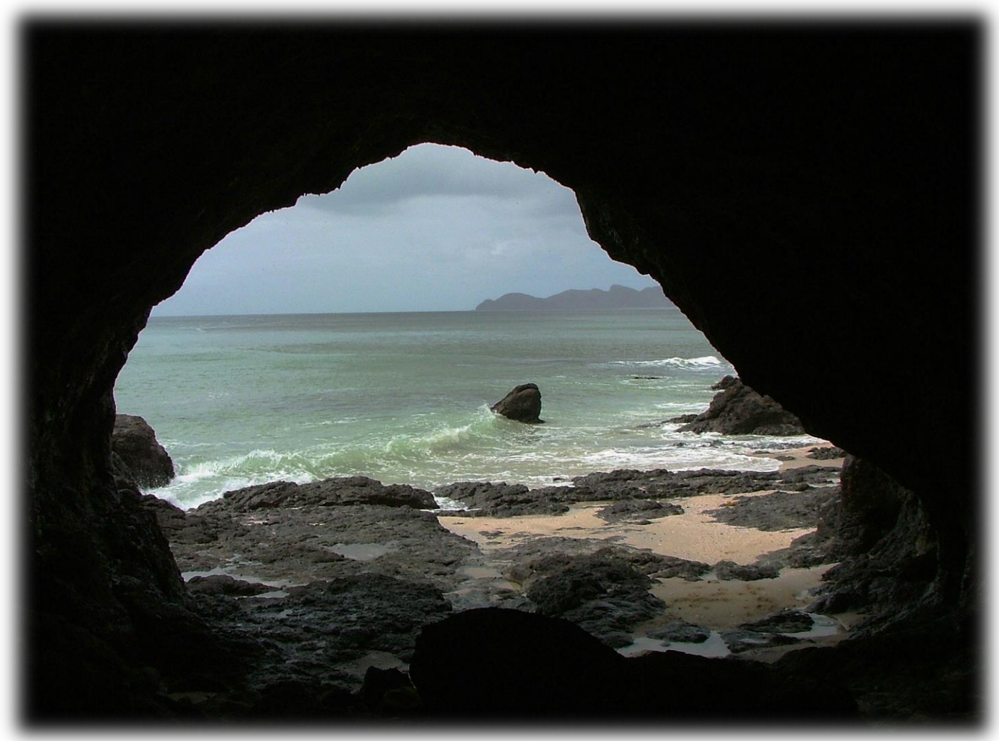
Photograph; cave near Kapowairua

This report is presented to the New Zealand Conservation Authority as required by the Conservation Act and distributed to interested parties.