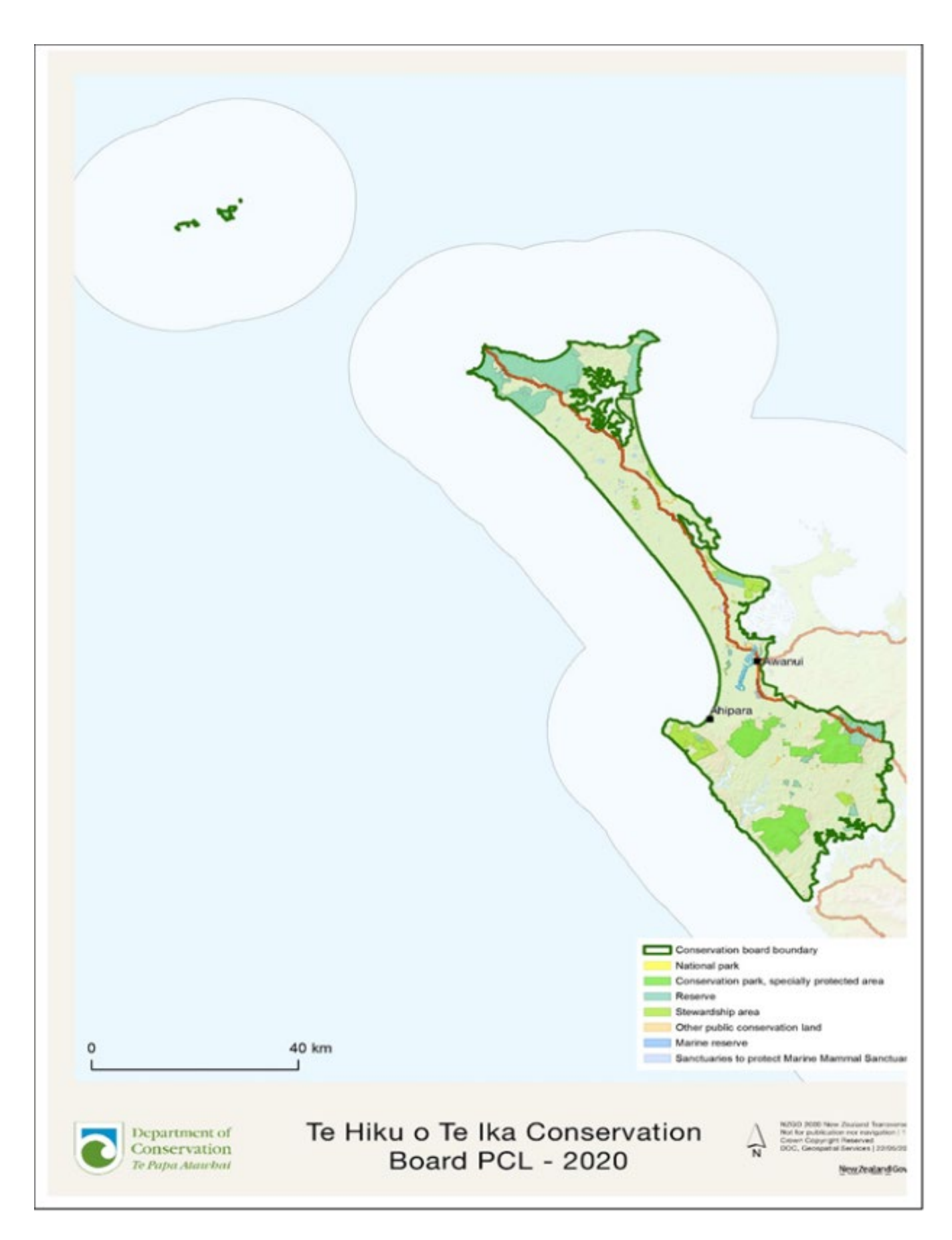
Figure #2: Te Hiku o Te Ika Conservation Board Jurisdiction