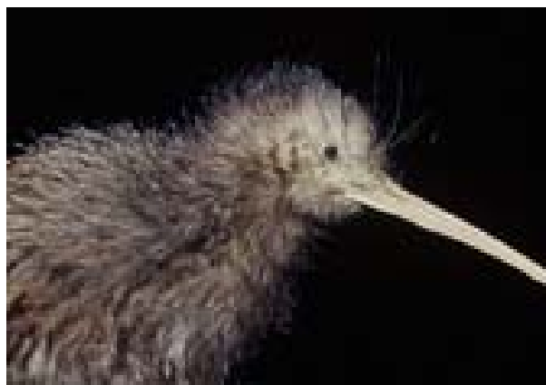
North Island Brown Kiwi