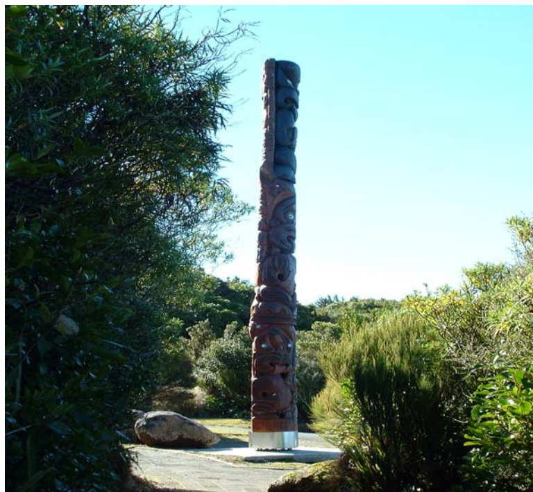
Powhenua – Dawson Falls Visitor Centre – Egmont National Park

Saturday 10 February: The Board visited the historic York Road Loop Track, viewing recent work completed on this site. Then they traveled to East Egmont and walked the barrier free Poteama Track. Finally they visited Dawson Falls Visitor Centre and viewed the pouwhenua, historic power station and road end developments. The Board was accompanied by the Board servicing officer and Stratford Area Office staff.