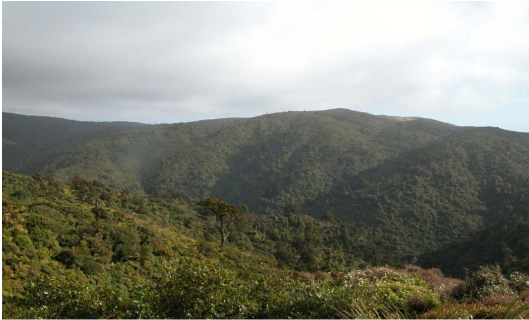
Turitea Reserve Skyline

The Board planned to visit Turitea Reserve where a proposed wind farm may be built. The Board was to be accompanied by DOC staff from Palmerston North and staff from the Palmerston North City Council. However upon arrival at the road leading up to the reserve, logging was taking place and they could not venture up the road as logging trucks were using the road. The inspection was abandoned.