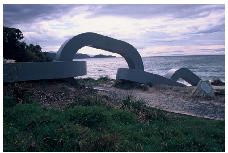
Entrance to Rakiura National Park

There are two National Parks within the Board's jurisdiction – Fiordland National Park and Rakiura National Park. Opened in 2002, Rakiura is New Zealand's newest National Park. It encompasses 139,000 hectares of land, and comprises 85% of New Zealand's third main island – Stewart Island/Rakiura. The Park extends from the northwest of the island to South Cape, and includes many offshore islands in Port Pegasus/Pikihatiti and Paterson Inlet/Whaka a Te Wera. The first Rakiura National Park Management Plan has been prepared and is awaiting approval by the New Zealand Conservation Authority.