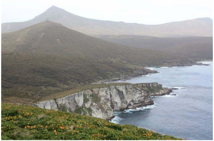
Campbell Island

the Auckland Islands and Campbell Island were honoured with World Heritage status in 1998. They are also National Nature Reserves under New Zealand's Reserves Act 1977. New Zealand's Subantarctic Islands are located in the Southern Ocean south to south-east of New Zealand. Spanning six degrees of latitude, from 47 to 52 degrees south, the five island groups occupy the stormy latitudes of the Roaring Forties and Furious Fifties, known also as the Albatross Latitudes. The islands contain a high degree of endemism and are home to a number of rare species of birds, plants, marine mammals and invertebrates. The New Zealand Subantarctic region supports the most diverse community of breeding seabirds in the southern ocean. Their isolation presents a number of challenges, and a separate Conservation Management Strategy outlines the way in which the islands should be managed.