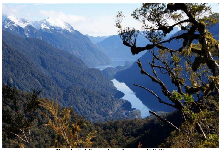
Doubtful Sound, (photo - DOC)

The Fiordland National Park, established in 1952, is the largest national park in New Zealand (1,260,200 hectares). At the heart of Te Wāhipounamu/South West New Zealand World Heritage Area, Fiordland National Park includes some of New Zealand's most iconic and special places such as Milford Sound/Piopiotahi. It has high cultural, historical and biodiversity significance and offers a wide range of visitor opportunities, from scenic viewing points to true wilderness experiences. The Fiordland National Park Management Plan sets out how the Park should be managed.