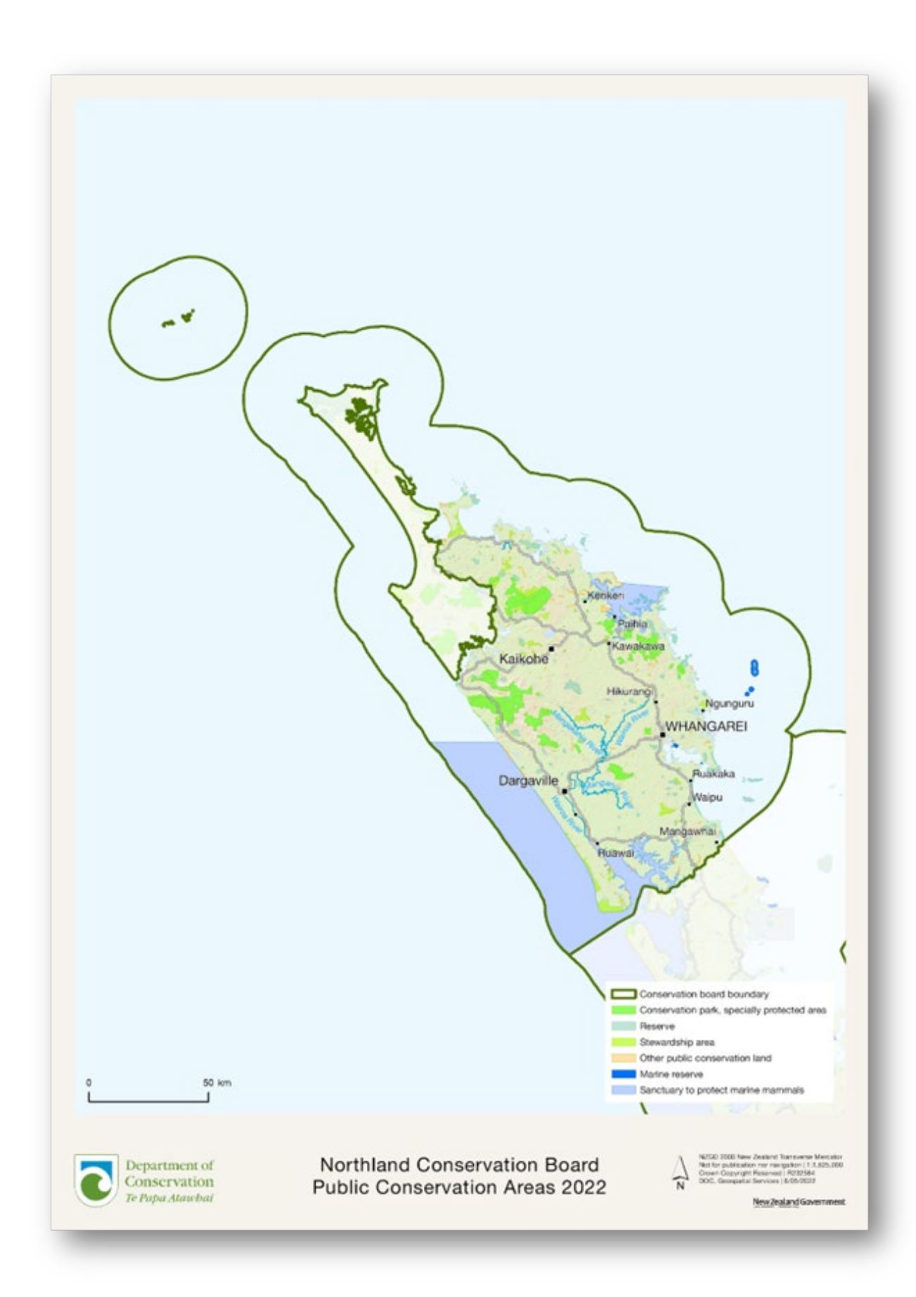
Figure 1. Northland Conservation Board Jurisdiction