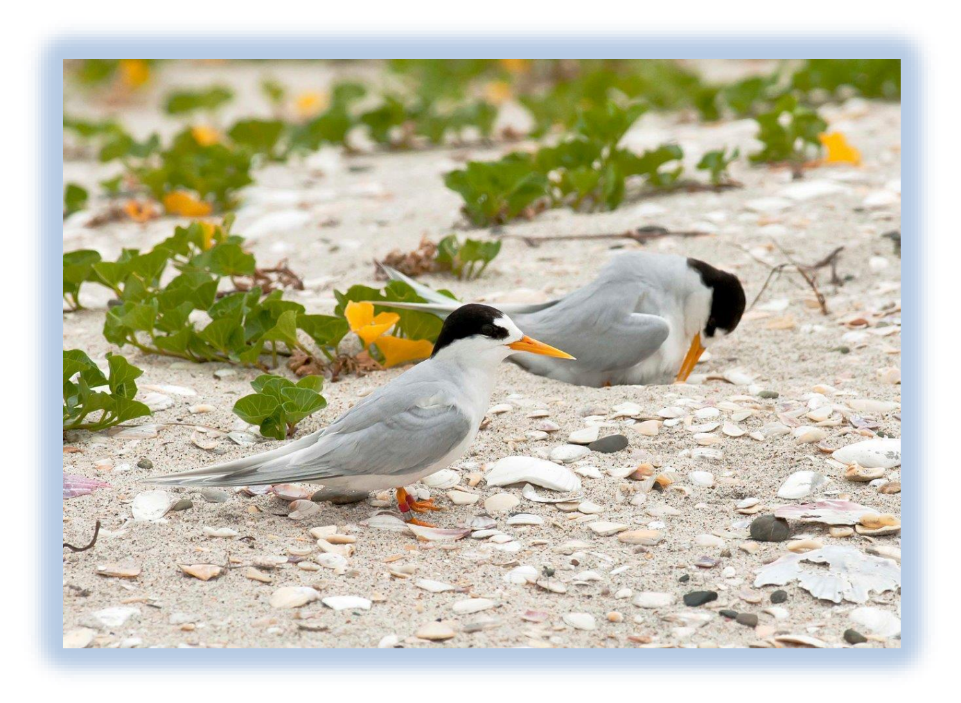
\ Tara\ iti\ /\ Ferry\ Tern\ pair\ on\ beach

This report is presented to the New Zealand Conservation Authority as required by the Conservation Act and distributed to interested parties. Members of the public are welcome to attend Conservation Board meetings. If you would like more information on the Northland Conservation Board, please: