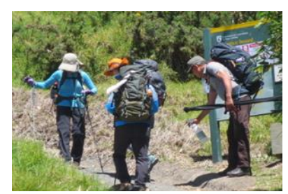
Tourists walking, Busby track, Mt Manaia taking a couple of minutes at a cleaning station.

In April 2015, the Board launched its "Save the Kukupa Campaign" and produced a poster for distribution to schools and other groups. We were pleased to add a Te Reo version of this poster this year and continue distribution.