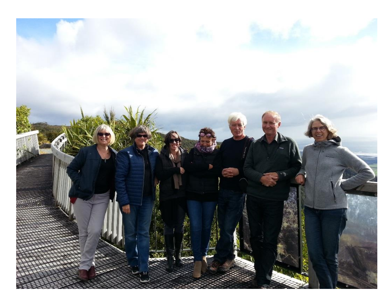
Radnenhesvithsaffonthelokota Denison Calnining Listoic Aca Paccaelt: Kählinwood