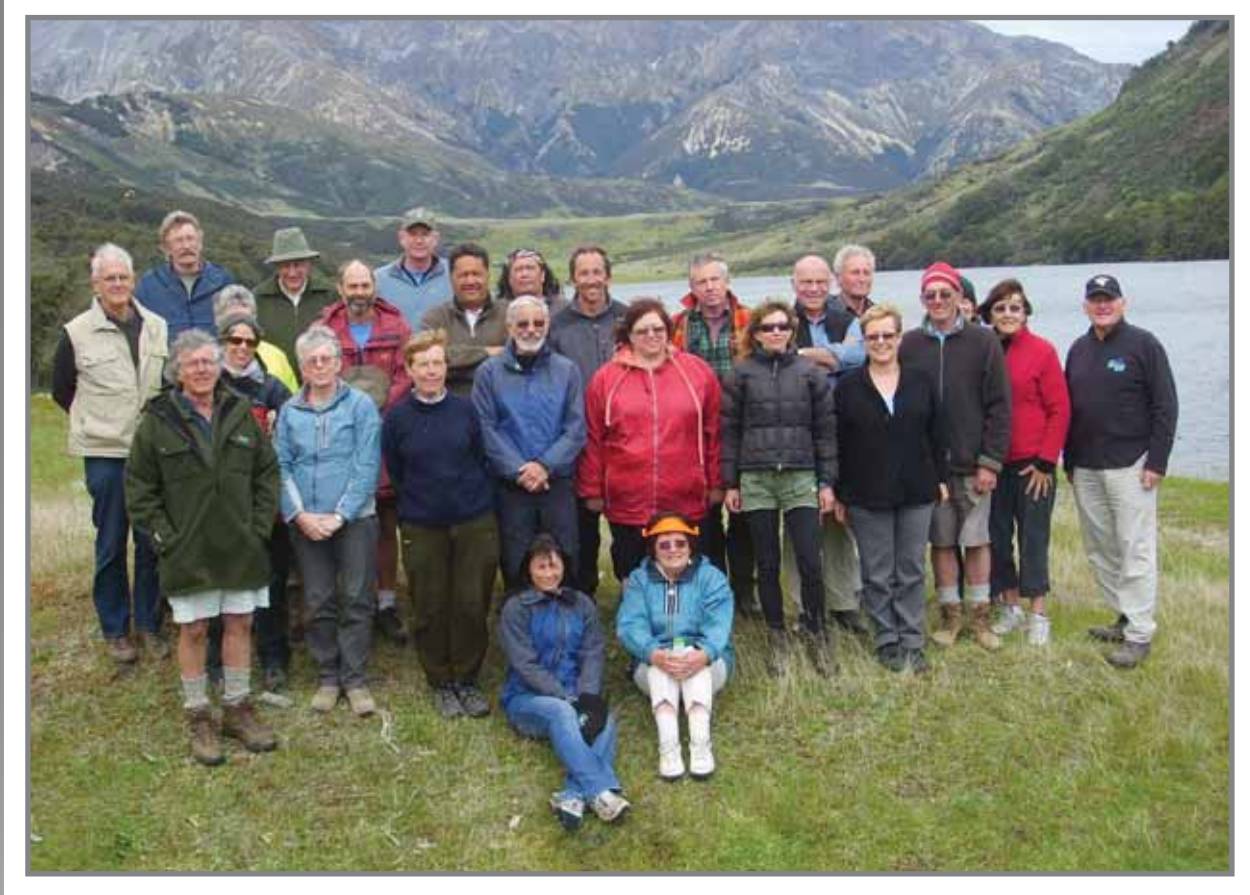
Members of Canterbury Aoraki and Nelson/Marlborough Conservation Boards and DOC staff at Lake Guyon

Members of both boards went on a field trip into the St James Conservation Area arranged by DOC's Waimakariri Area staff. The St James Conservation Area is adjacent to both Molesworth Station and Nelson Lakes National Park, both of which are in the Nelson/Marlborough Conservancy. The Board appreciated seeing this area and hearing the Department's intentions for its management.