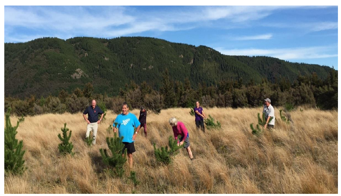
Photo: Board members show Wilding Pine infestation near Comet (Kōmata) Hut, Kaweka Forest Park, April 2016.

The Board liaises with CF projects that have a focus on supporting native bird species through habitat protection and regeneration, and breeding programmes.