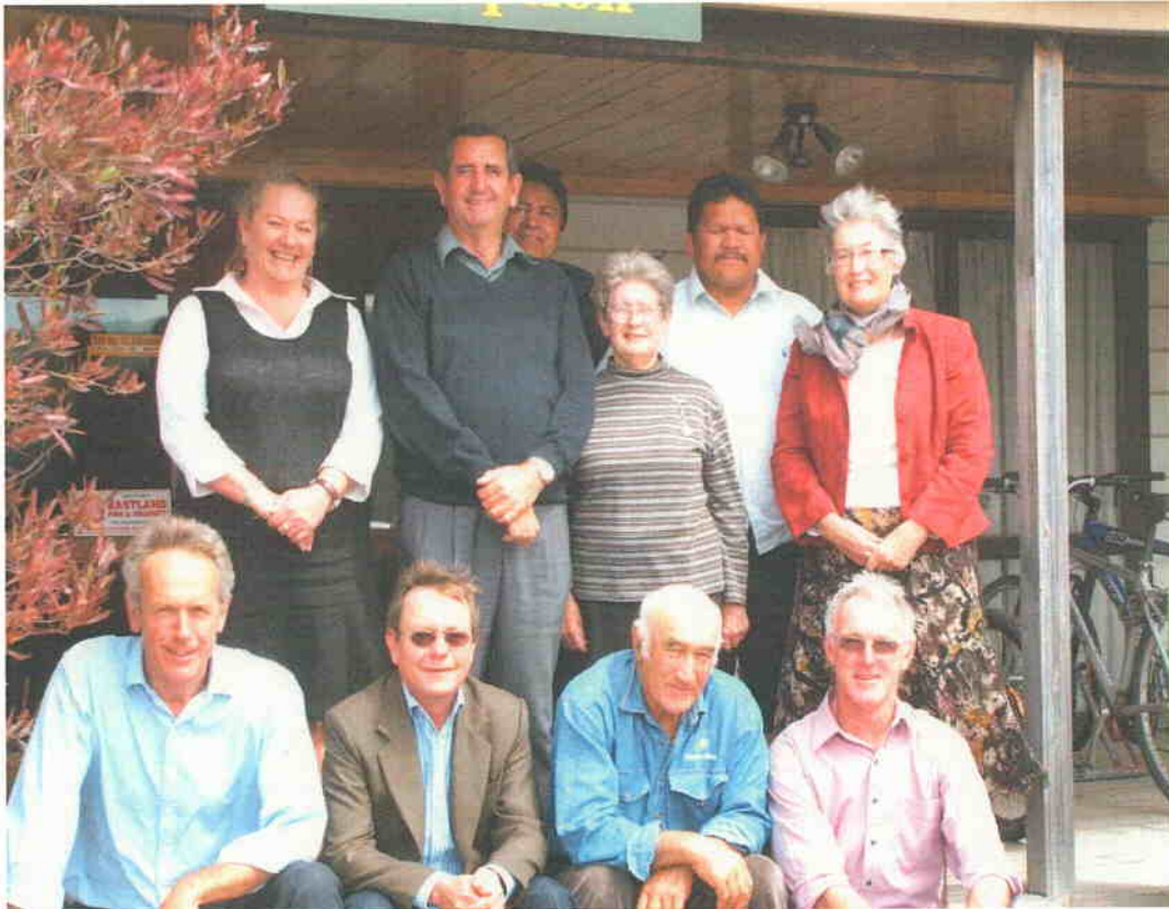
Members of the East Coast Hawke's Bay Conservation Board: