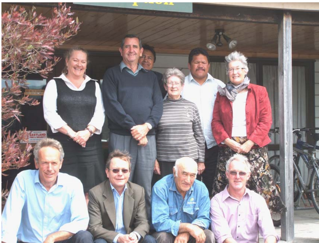
Members of the East Coast Hawke's Bay Conservation Board :