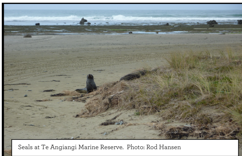
Seals at Te Angiangi Marine Reserve.

On the central Hawke's Bay coast approximately 30 km east of Waipukurau and Waipawa, Te Angiangi Marine Reserve protects a piece of coastline of approximately 446 ha.