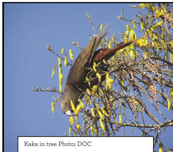
Kaka in tree

Many native birds can be found in the area including the North Island brown kiwi, New Zealand falcon (karearea), North Island kaka, and the blue duck. Ten native freshwater fish species have been recorded in the Mohaka River.