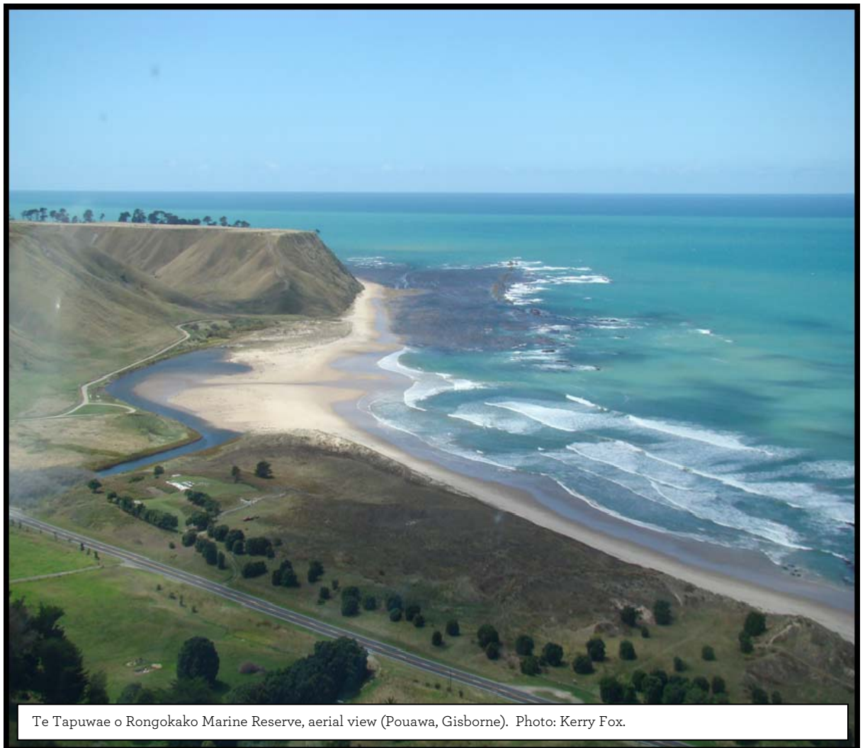
Te Tapuwae o Rongokako Marine Reserve, aerial view (Pouawa, Gisborne).