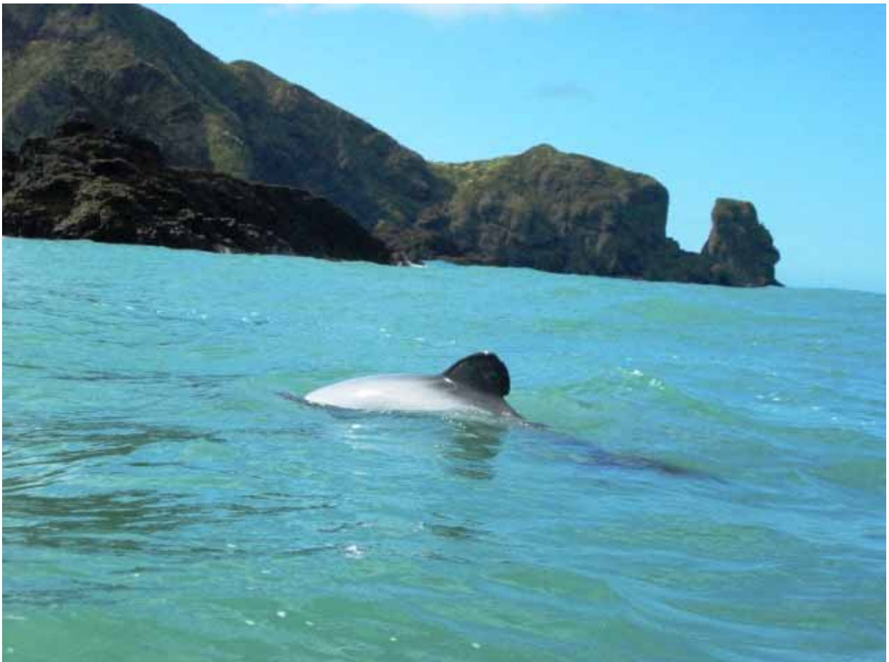
Maui's dolphin