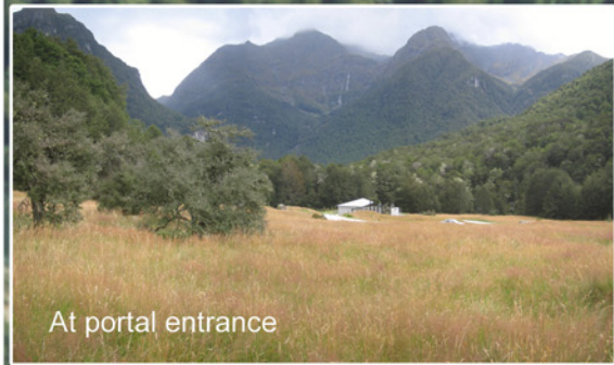
At portal entrance

NOTE : This plan to be read in conjunction with URS Report 24 Jan 2011