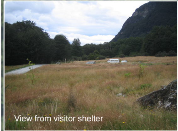
View from visitor shelter