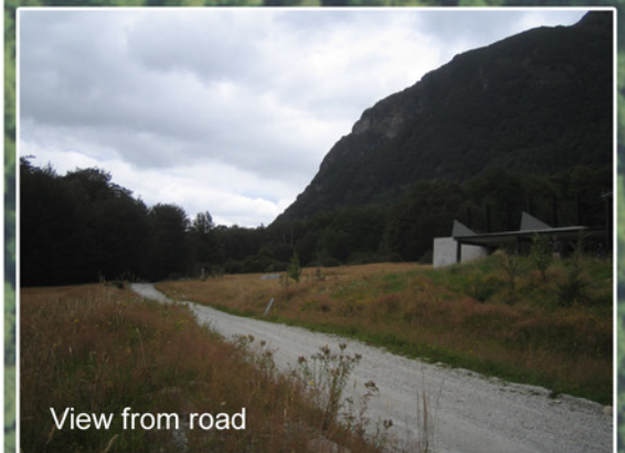
View from road