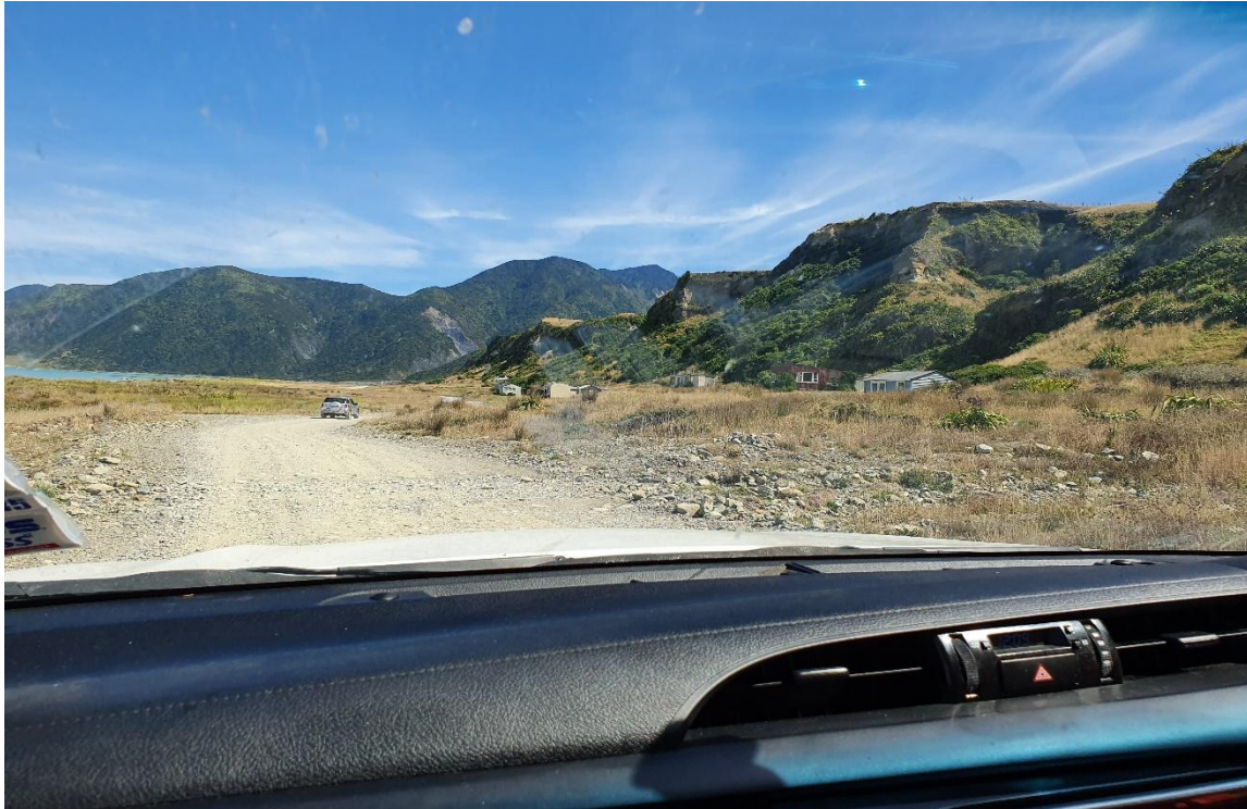
Ocean Beach Bach Photos – Matt Sell – April 2021