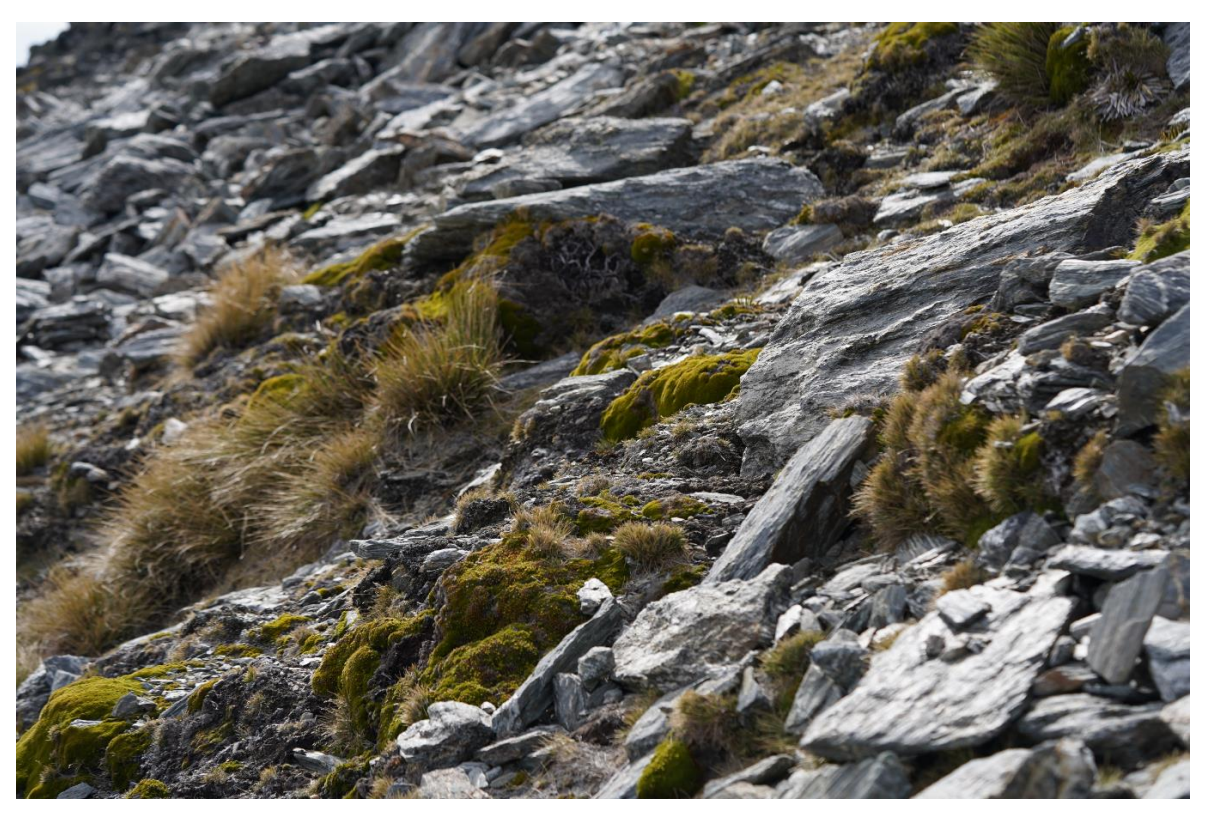
Plate 1: Rock jumble lizard habitat along the proposed Shadow Basin chairlift and ski access at Cushion Trail. 15 December 2021.