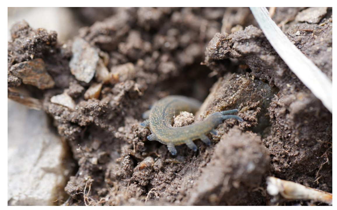
Plate 2: Ngaokeoke/peripatus found at the Remarkables within the proposed Shadow Basin Chairlift upgrade footprint. 15 December 2021.