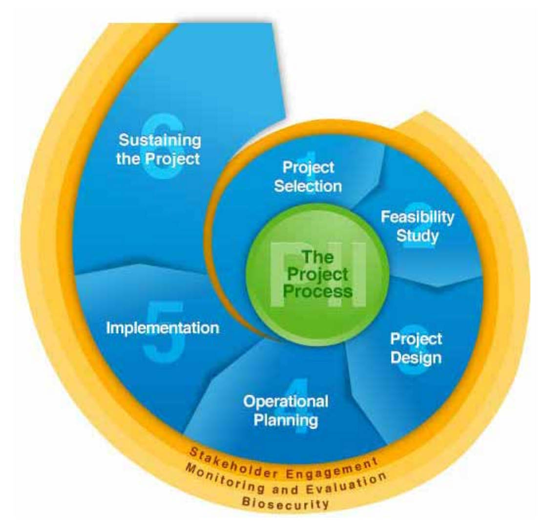
Figure 2. Pacific Invasives Initiative eradication resource kit project process diagram. This diagram is borrowed with permission from the Pacific Invasives Initiative (PII)

http://www.pacificinvasivesinitiative.org/ It shows the typical stages in the life cycle of an eradication project and how stakeholder engagement, monitoring and evaluation, and biosecurity are ongoing activities relevant to every stage. A wealth of useful guidance, document templates and examples are available in this resource kit.