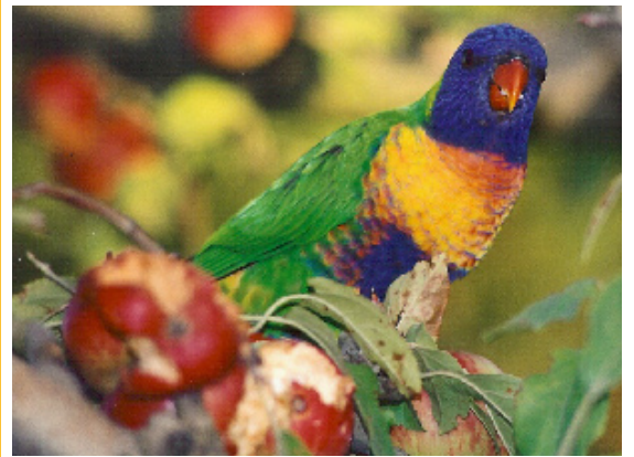
Rainbow lorikeet damaging apples

Rainbow lorikeets may also carry avian diseases which can threaten the health of native bird species.