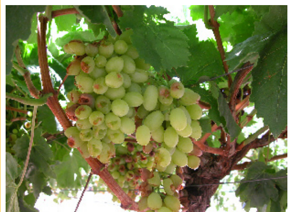
Damage to grapes caused by rainbow lorikeets