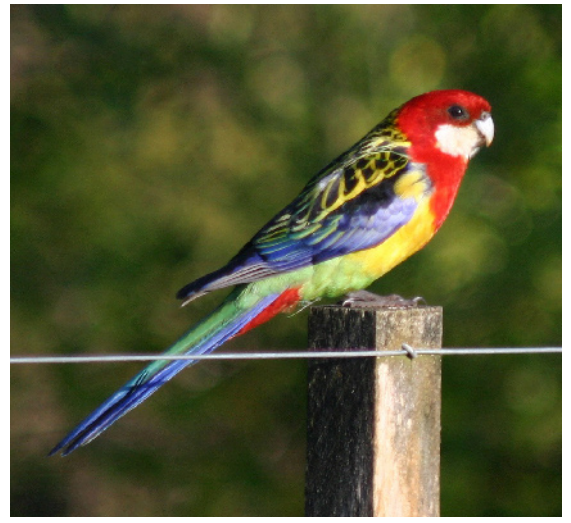
Identity can be mistaken with the eastern rosella

MAF Biosecurity New Zealand Freephone: 0800 80 99 66