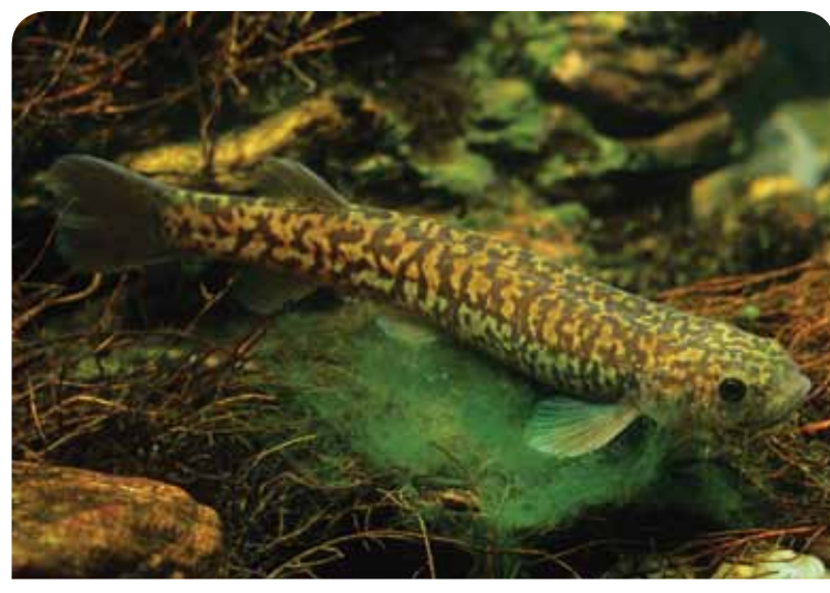
Southern flathead galaxias

These Southlanders buck the trend of galaxiids, which are usually found high up in headwater streams where predators cannot reach them. Instead, southern flatheads are more generally found in the mid-to-lower reaches of gravel- and cobble-laden streams and rivers.