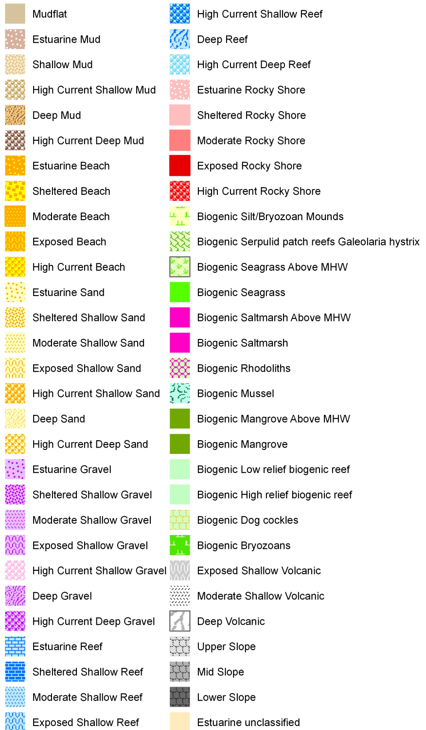
APPENDIX 8. LEGEND FOR COASTAL MARINE HABITATS.