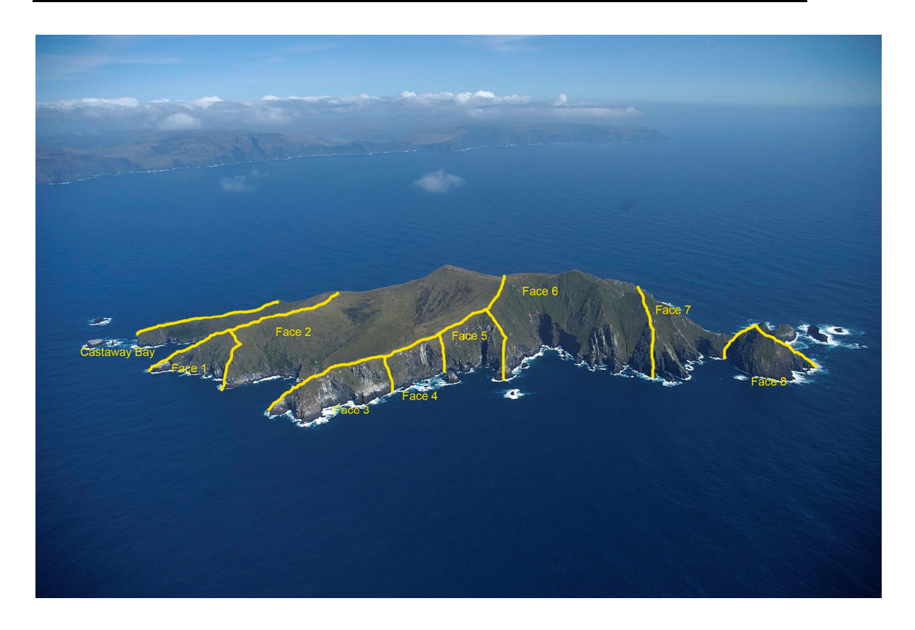
Figure 1. Boundary of photographic montages 1 to 8 and Castaway Bay, Disappointment Island