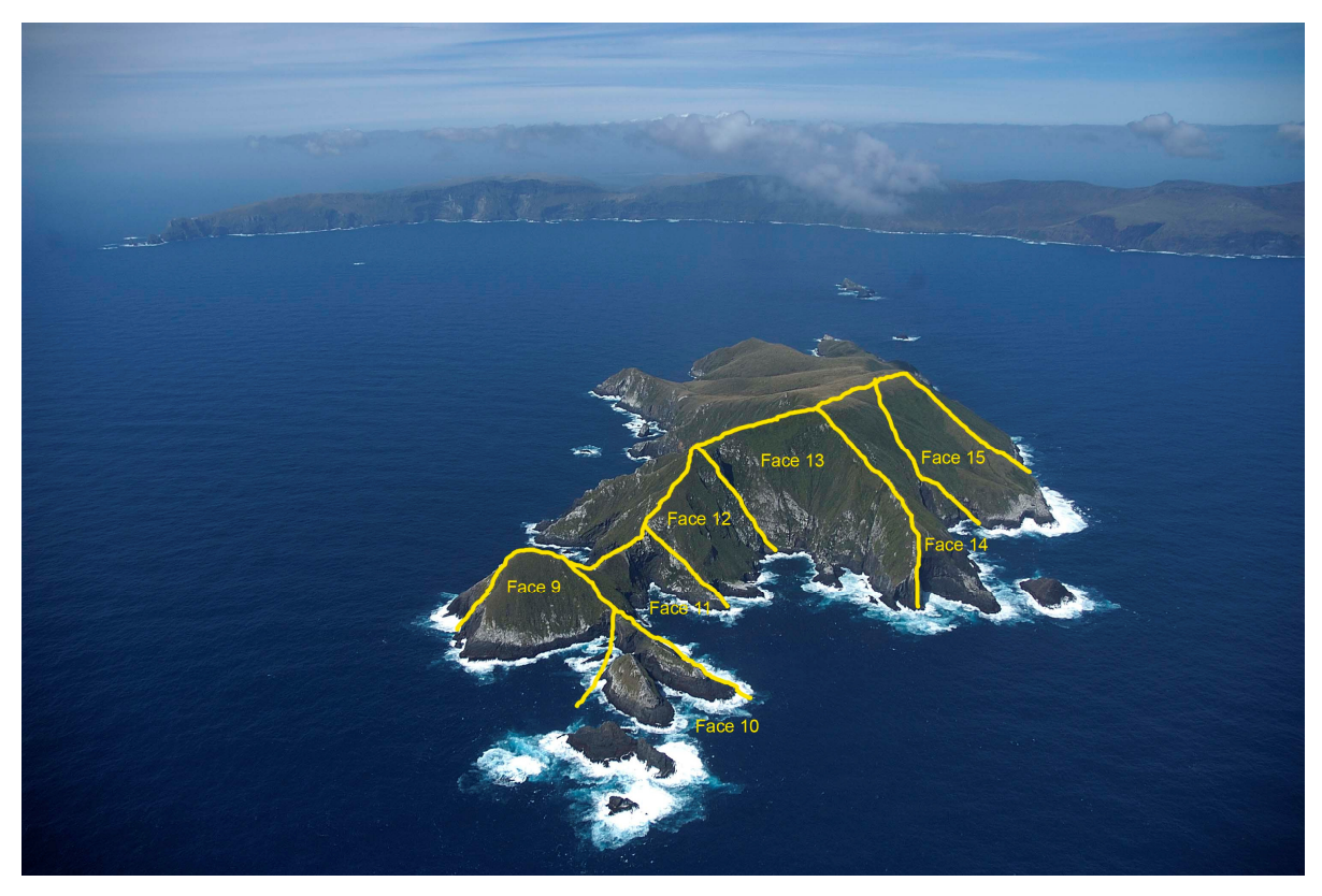
Figure 2. Boundary of photographic montages 9 to 15, Disappointment Island