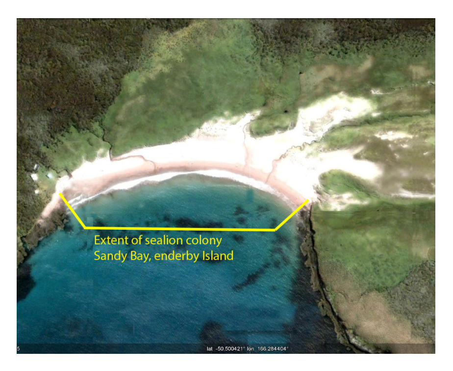
Figure 1. Sandy Bay, Enderby Island showing extent of New Zealand sea lion colony