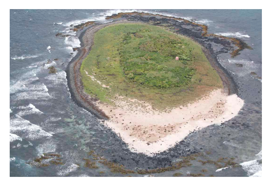
Figure 2. Dundas Island. New Zealand sea lions principally pup and mate on the sandy beach in the foreground. As the breeding season advances, females and pups move into the vegetation and can be found throughout the island.

The entire set of photographs was downloaded and subsequently replicated to ensure that adequate back-up sets were available for storage in at least three different locations. A full collection of photographs have been submitted to the Department of Conservation for archiving.