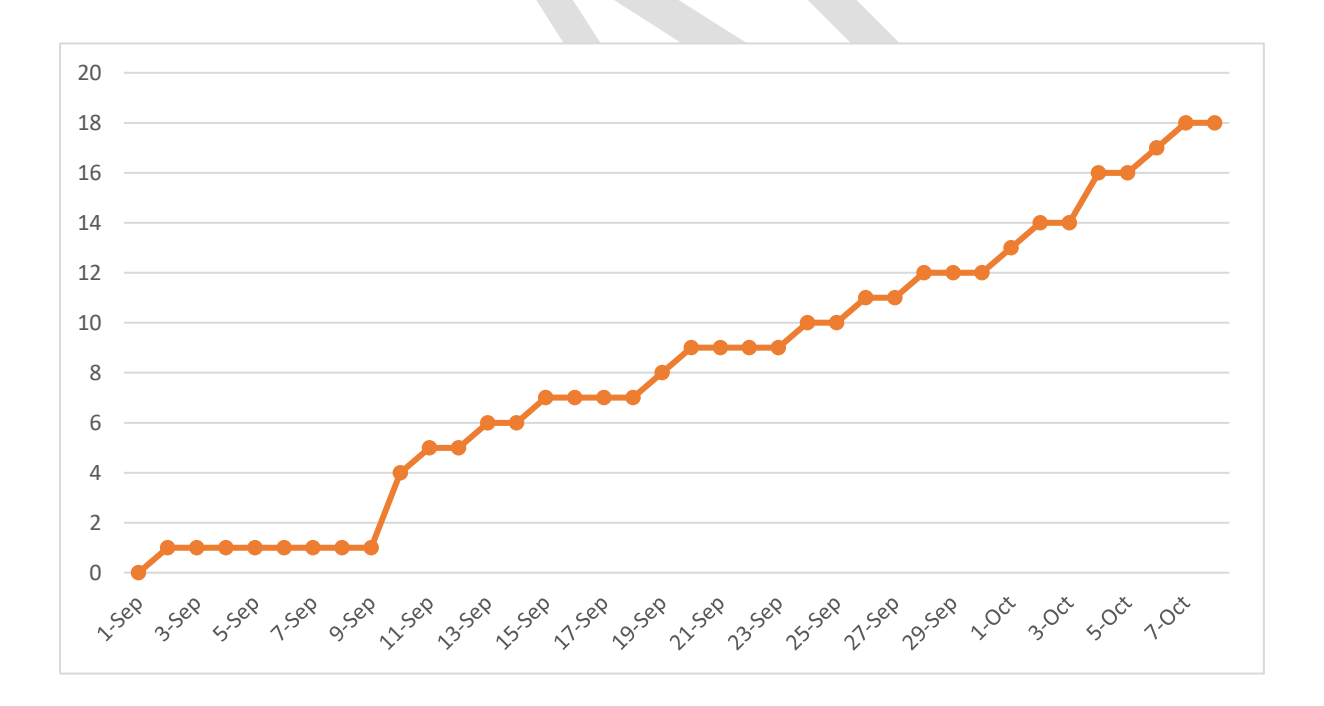
Figure 2. Culminative number of Northern Royal Albatross chicks fledged as recorded by cameras deployed on Motuhara, September/October 2021.

The four cameras that worked throughout the season covered a total of 24 nests where the fate of chicks could be followed through to fledging. Vegetation growth from August and the movement of chicks as they aged meant following the fate of individual chicks was often difficult and limited the field of view and hence nests which could be followed. Of the 24 chicks present in January 2021, 3 died, but a further 4 went "missing" in early August, these birds disappeared from the field of view, and were considered too young to have fledged, so are considered to have perished. A total of 17 chicks fledged, 70% of chicks observed, from September 2<sup>nd</sup> to October 7<sup>th</sup> (Figure 2).