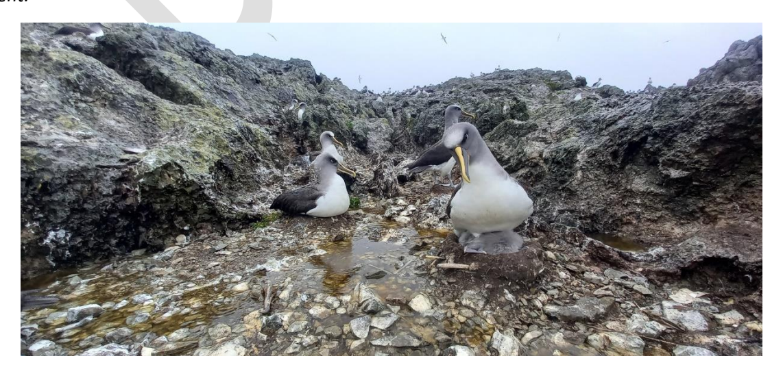
Figure 1. Photo of part of Buller's mollymawk colony showing water pooling during a c.20mm rainfall event.

As during last year's field trip, and a continuation of the trend over the past two decades, during this trip we found the island to have relatively deep soil and well vegetated. The poor weather we experienced had little impact on the vegetation.